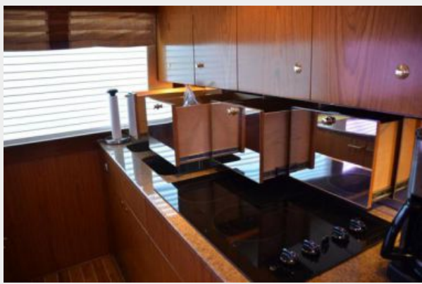
58 Davis Galley Storage