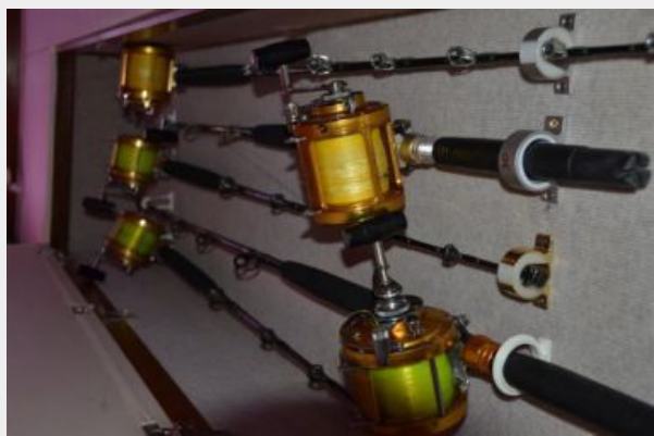
58 Davis Overhead Rod Storage