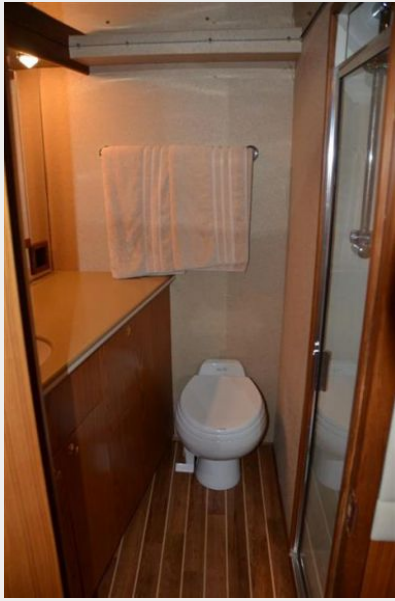
58 Davis Master Head