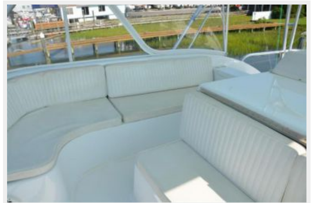
58 Davis Bridge Seating