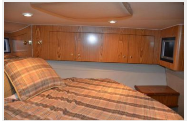
58 Davis VIP Stateroom