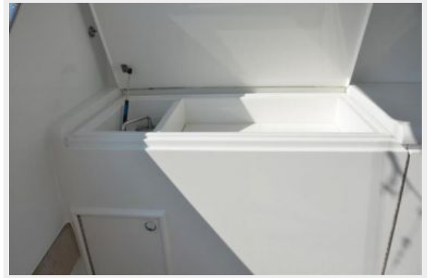
58 Davis Cockpit Sink and Freezer