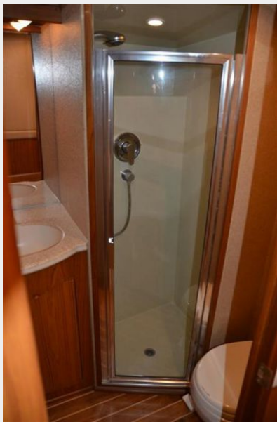
58 Davis VIP Head