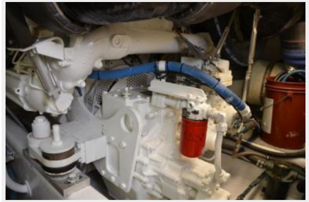
58 Davis Stbd Gear