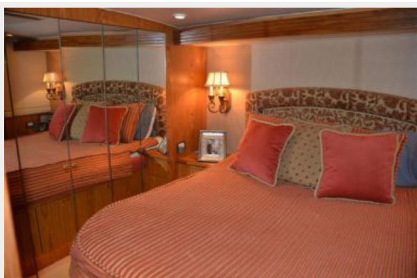
58 Davis Master Stateroom