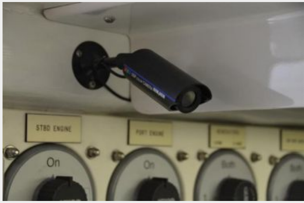
58 Davis Engineroom Camera