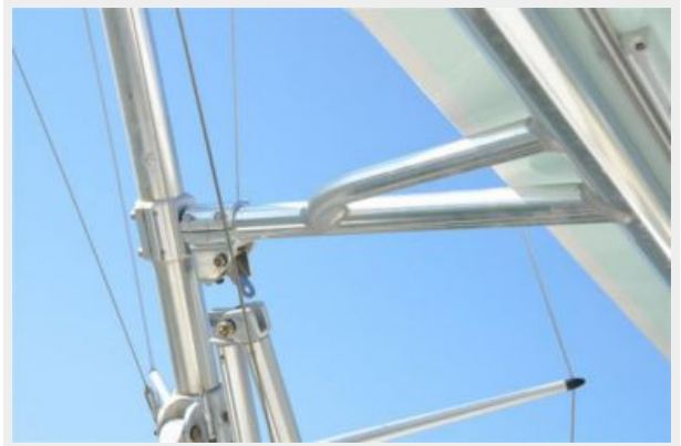
58 Davis Outrigger Auto Locks