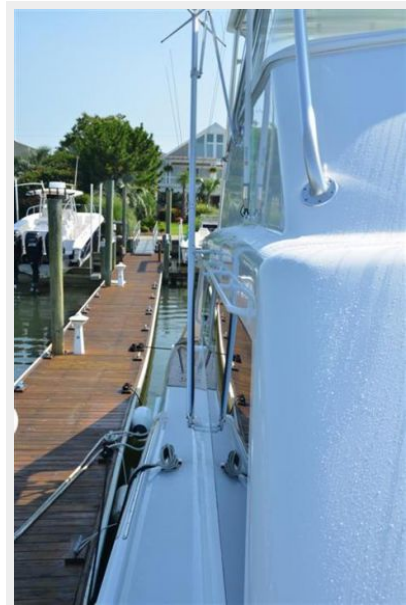
58 Davis Stbd Side