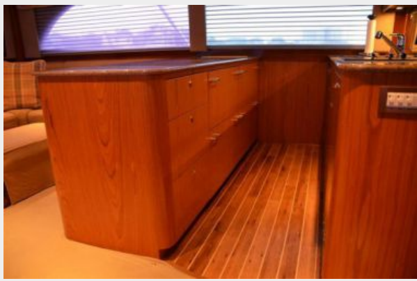
58 Davis Galley 1