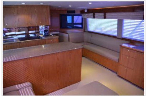
58 Davis Bar/ Storage