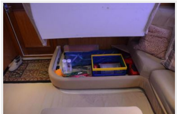
58 Davis Sofa Storage