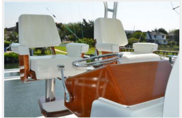
58 Davis Helm Chairs