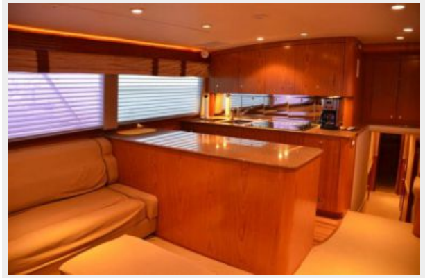
58 Davis Galley