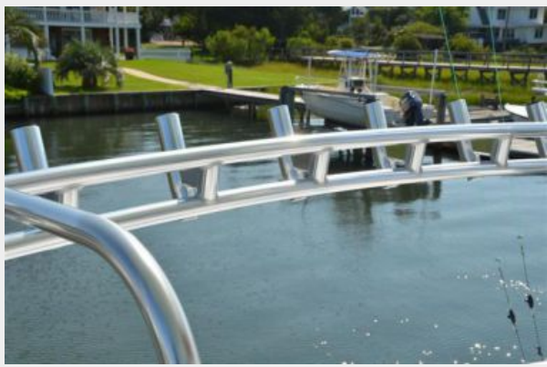
58 Davis Aft Bridge Rail