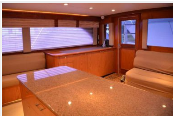
58 Davis Stbd Salon