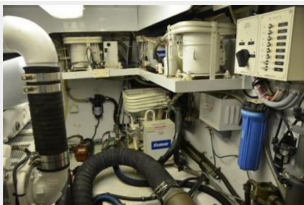
58 Davis A/C Units