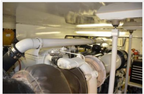
58 Davis Port Main Engine