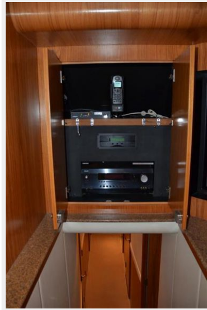
58 Davis Stereo