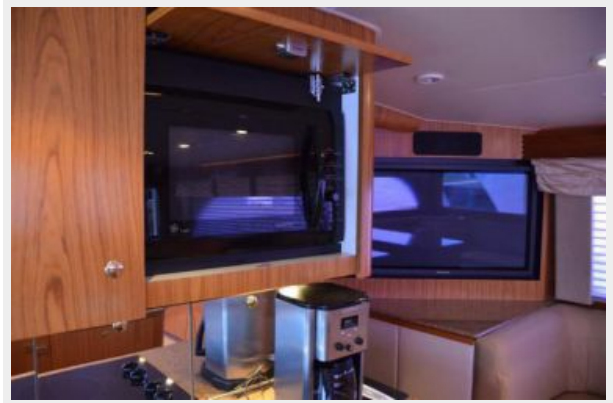
58 Davis Microwave