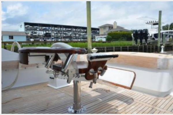
58 Davis Fighting Chair