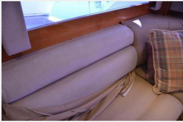
58 Davis Ultra Suede