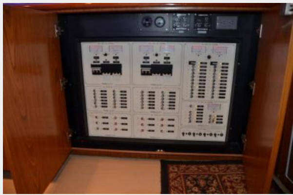
58 Davis Electrical Panel