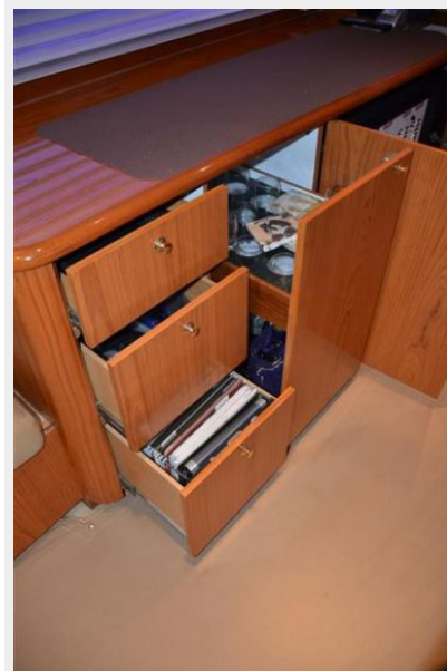
58 Davis Bar/ Storage