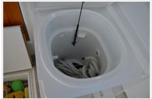
58 Davis Livewell