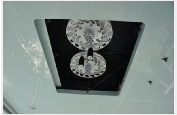
58 Davis Teaser Reels