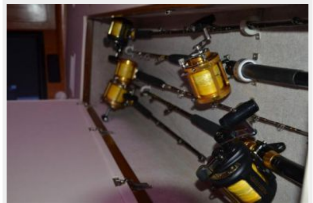
58 Davis Overhead Rod Storage 1