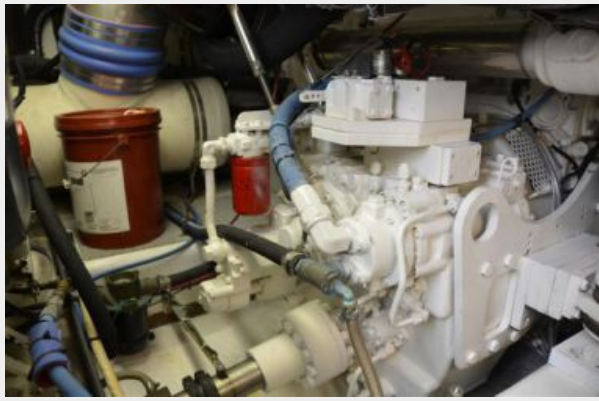
58 Davis Port Gear