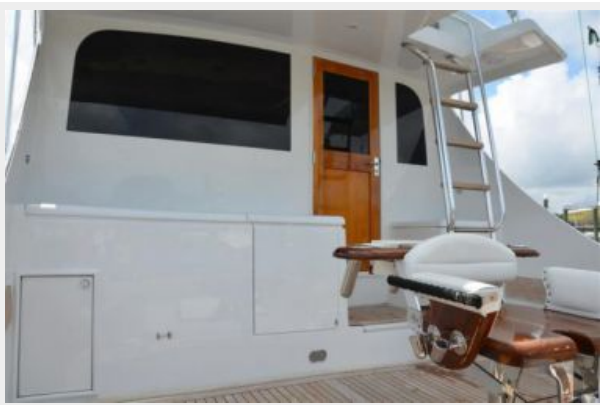
58 Davis Cockpit