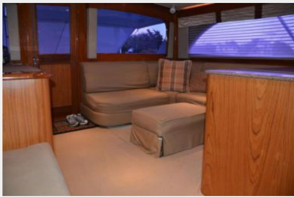
58 Davis Salon