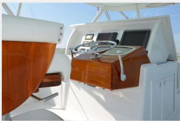
58 Davis Console