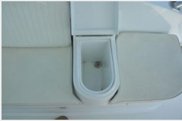
58 Davis Bridge Cooler 1