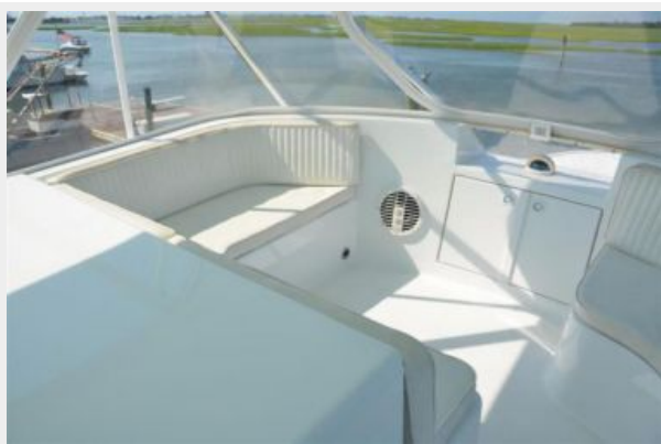
58 Davis Bridge Seating 1