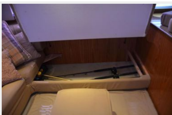
58 Davis Rod Storage