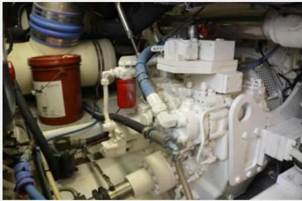
58 Davis Port Gear