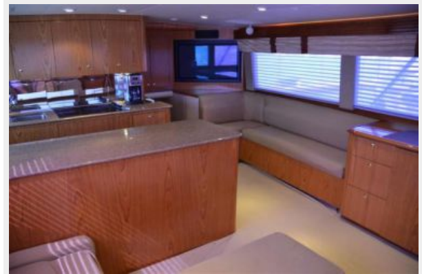
58 Davis Bar/ Storage