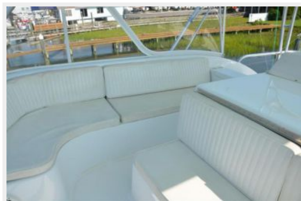
58 Davis Bridge Seating