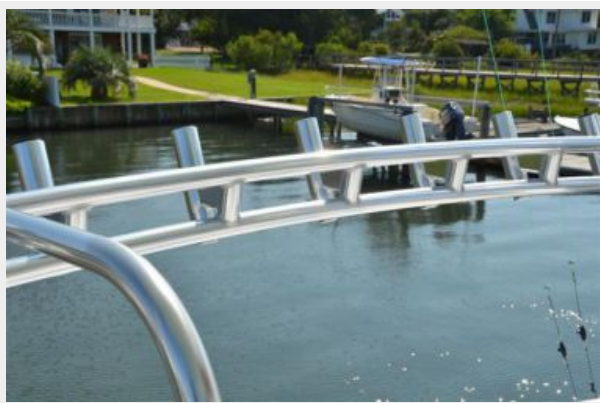
58 Davis Aft Bridge Rail