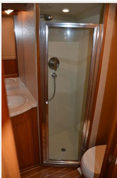
58 Davis VIP Head