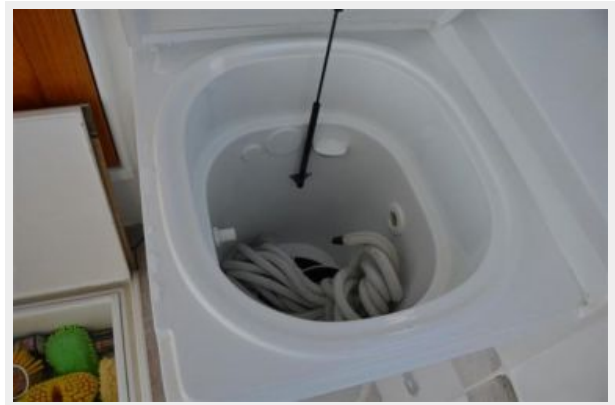
58 Davis Livewell