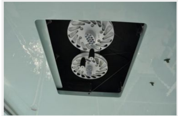
58 Davis Teaser Reels