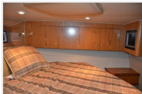
58 Davis VIP Stateroom