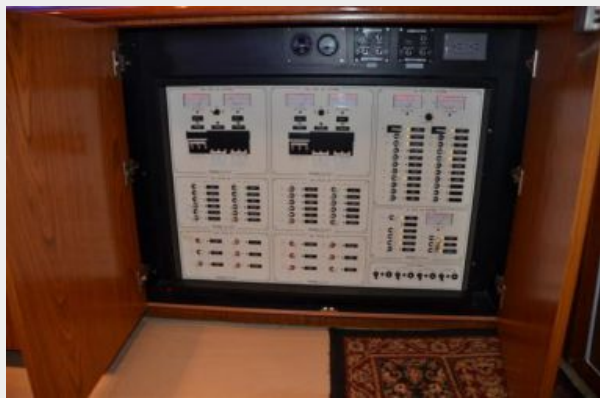
58 Davis Electrical Panel