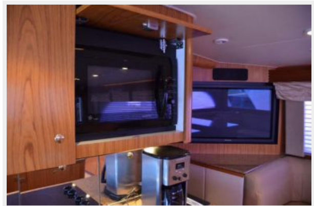
58 Davis Microwave