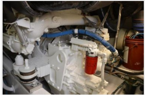
58 Davis Stbd Gear