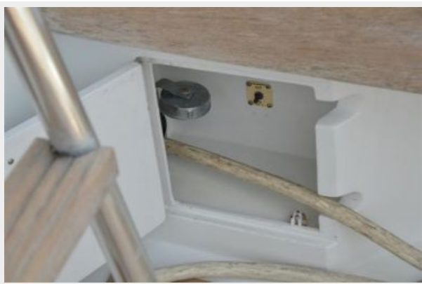
58 Davis Cablemaster Stbd