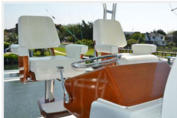
58 Davis Helm Chairs