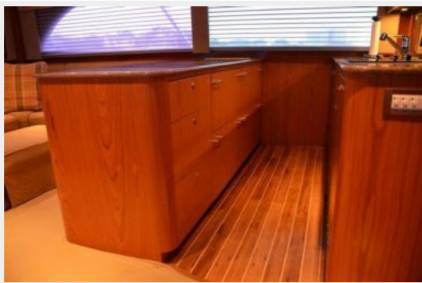
58 Davis Galley 1