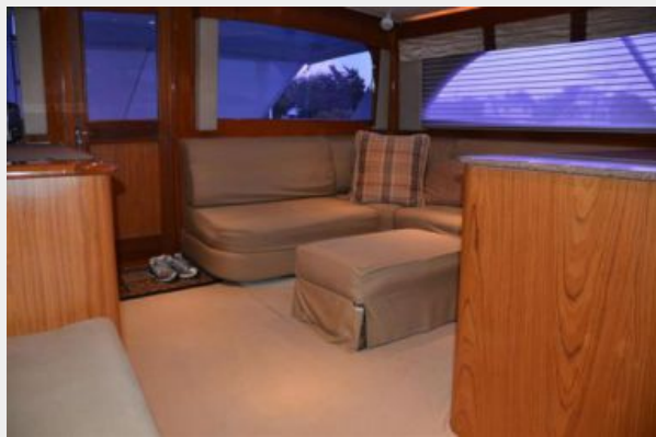
58 Davis Salon