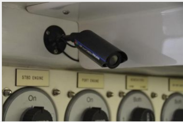
58 Davis Engineroom Camera