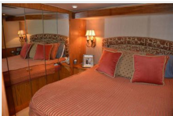
58 Davis Master Stateroom