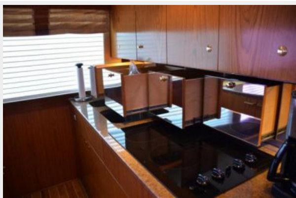
58 Davis Galley Storage