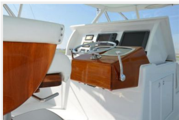
58 Davis Console