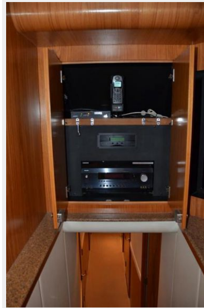
58 Davis Stereo