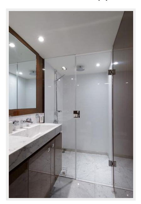
Master Head (2)