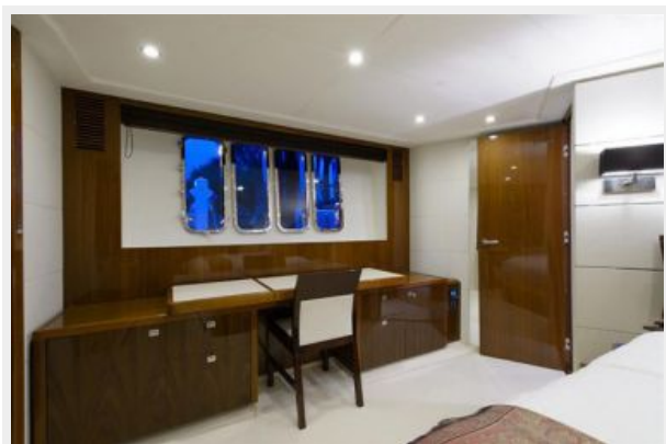
Master Vanity to Port