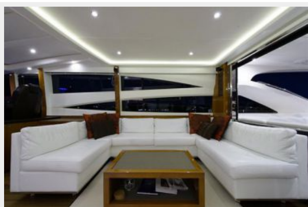
Salon to Starboard