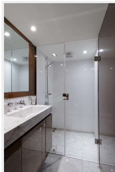
Master Head (1)