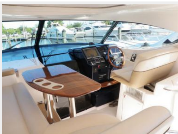
Upper Cockpit 1