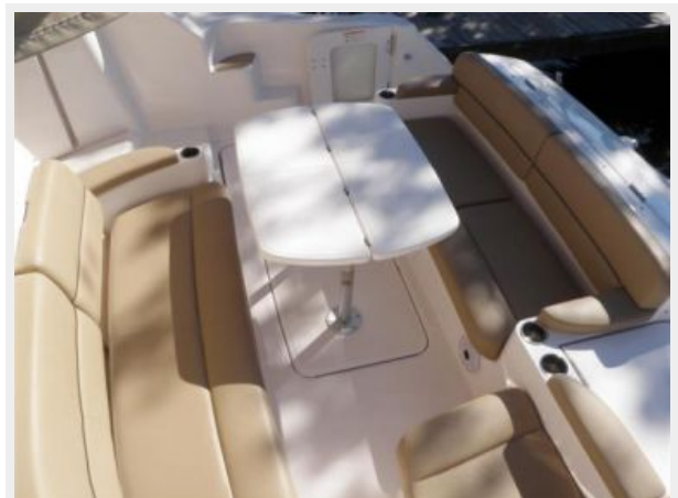
Aft Cockpit 2