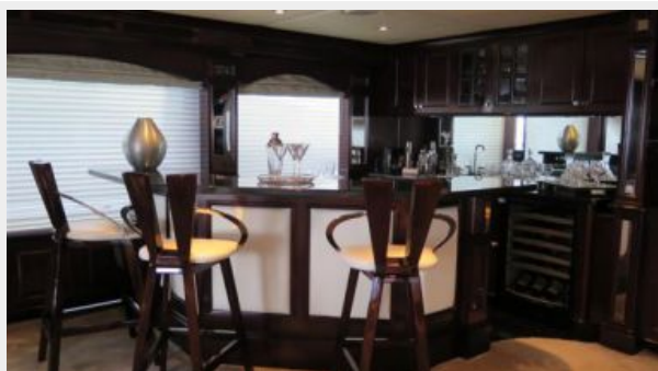
Sky Lounge Bar