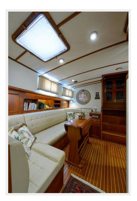
Galley - TV for Salon view