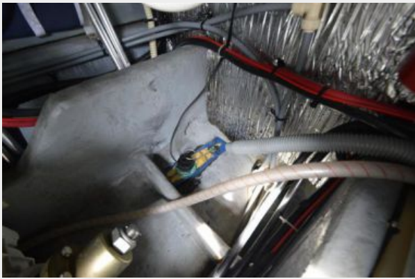
1995 Sea Ray 440 DA, New Transducer