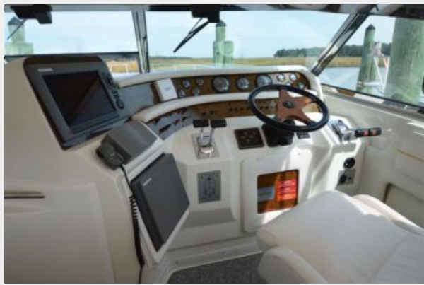
1995 Sea Ray 440 DA, Helm Station