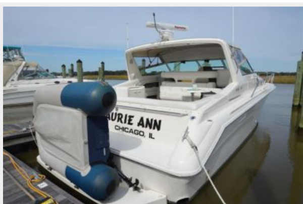
1995 Sea Ray 440 DA, Stbd Dibnghy; Not Included in Sale