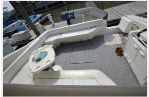
1995 Sea Ray 440 DA, HUGE Cockpit