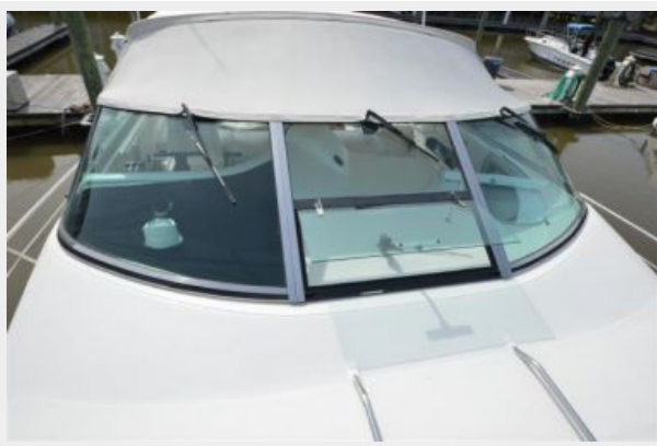
1995 Sea Ray 440 DA, Windshield