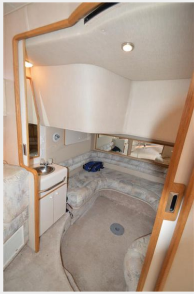
1995 Sea Ray 440 DA, Mid-Cabin Sink, Vanity