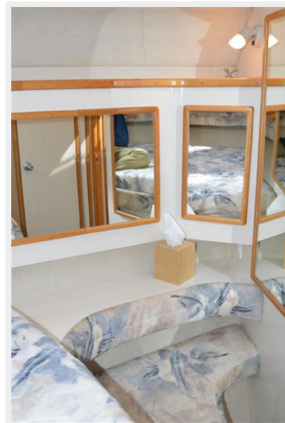
1995 Sea Ray 440 DA, MSR great storage