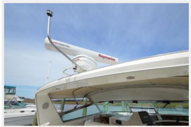
1995 Sea Ray 440 DA, HD Radar Antenna