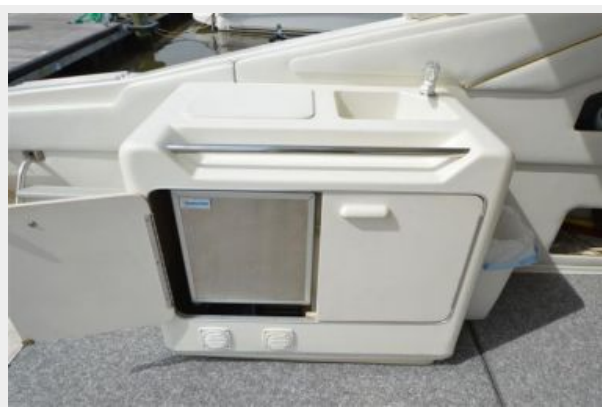
1995 Sea Ray 440 DA, NEW Ice Maker