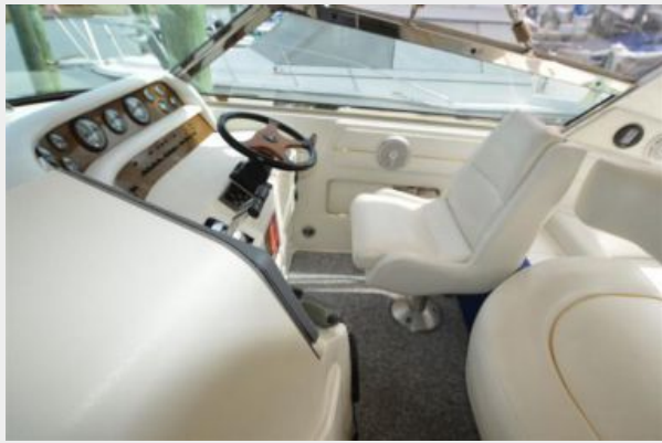
1995 Sea Ray 440 DA, Helm Seat