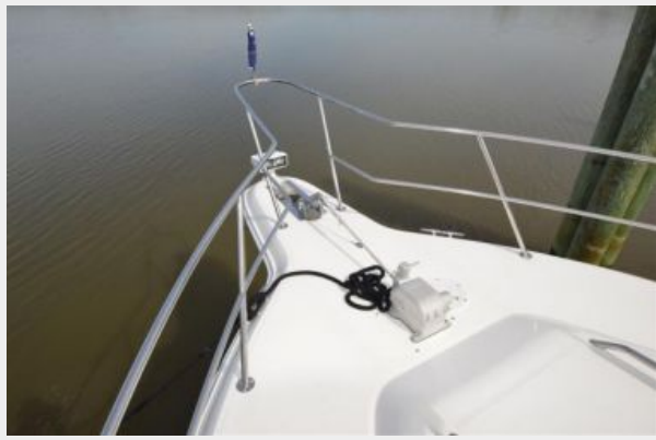
1995 Sea Ray 440 DA, Anchor, Windlass, & Remote Spotlight