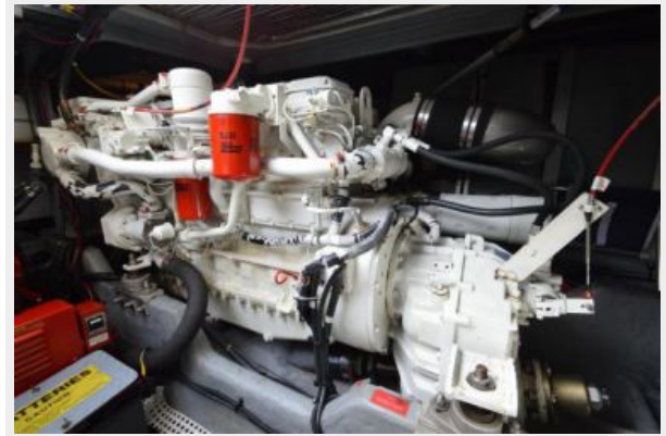
1995 Sea Ray 440 DA, Port Engine