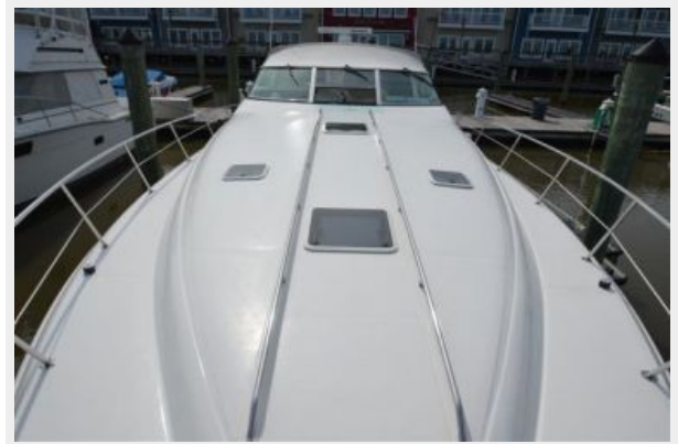
1995 Sea Ray 440 DA, Looking Aft