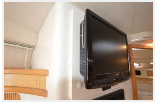
1995 Sea Ray 440 DA, HDTV w/ built in DVD player