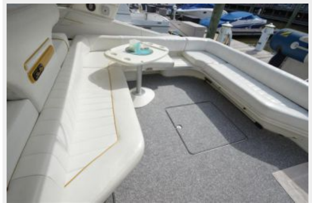
1995 Sea Ray 440 DA, New Cockpit Carpet