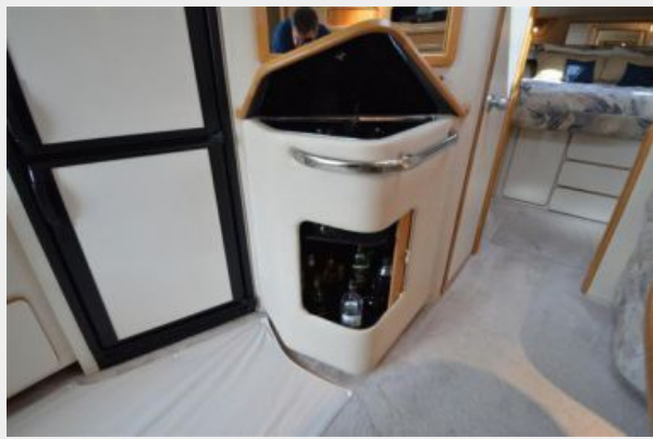
1995 Sea Ray 440 DA, Bottle Storage