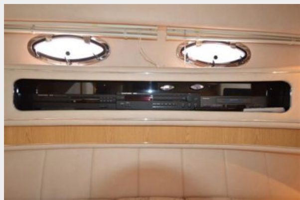
1995 Sea Ray 440 DA, Salon Stereo Equipment