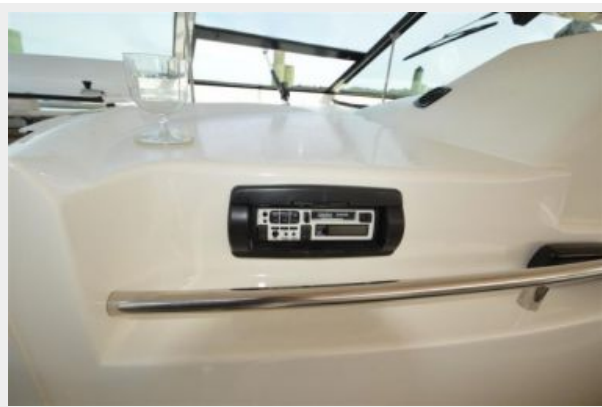
1995 Sea Ray 440 DA, Helm & Cockpit Stereo