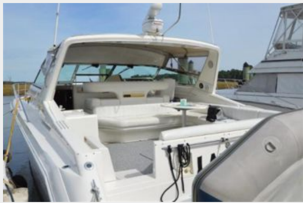
1995 Sea Ray 440 DA, port stern