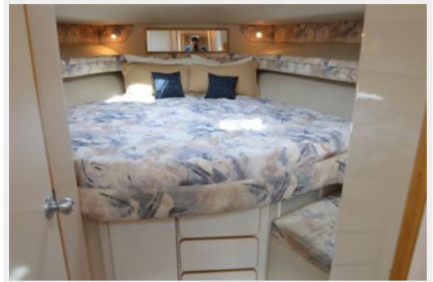
1995 Sea Ray 440 DA, MSR great storage