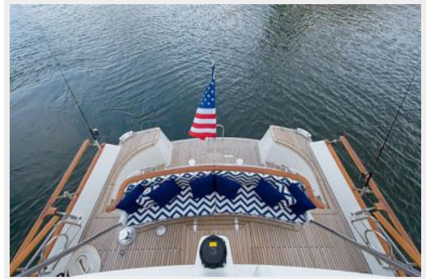
Aft view from FB