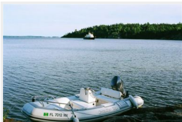
Tender in water