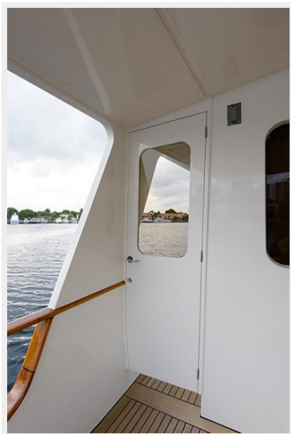
Side Deck Door