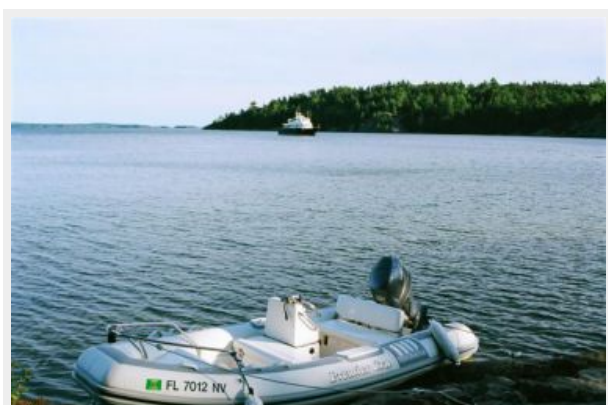
Tender in water