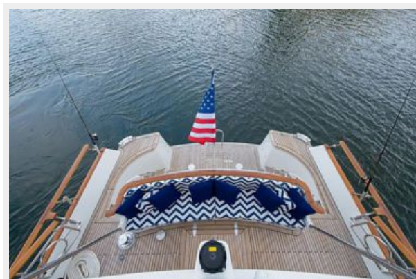
Aft view from FB