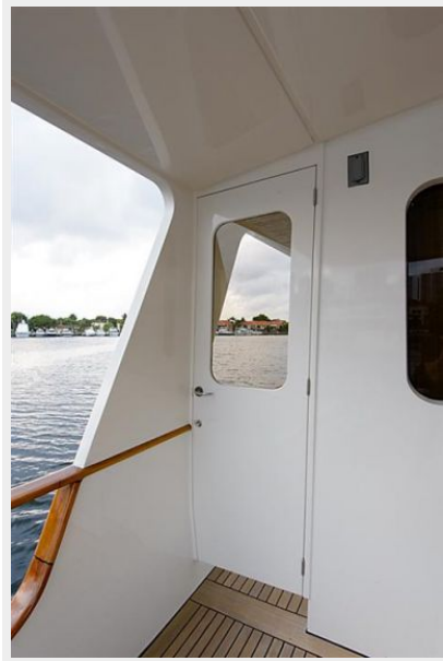
Side Deck Door