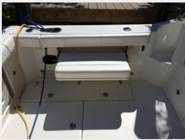
Port Side Bench