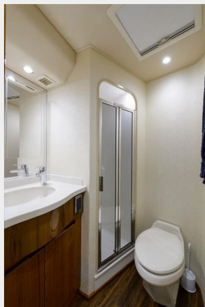
Forward Starboard Guest Head