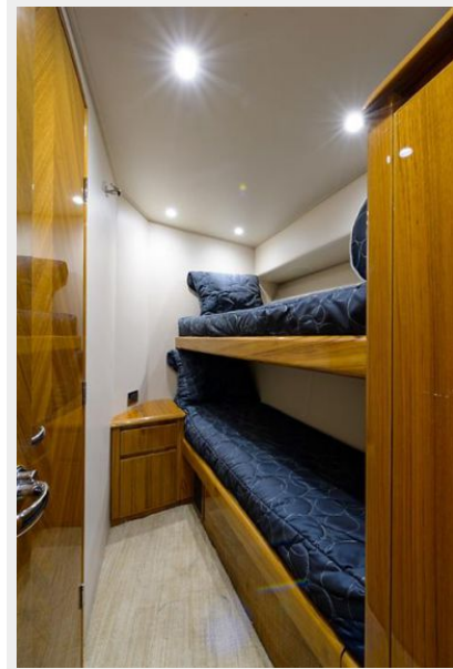
Forward Starboard Guest Stateroom