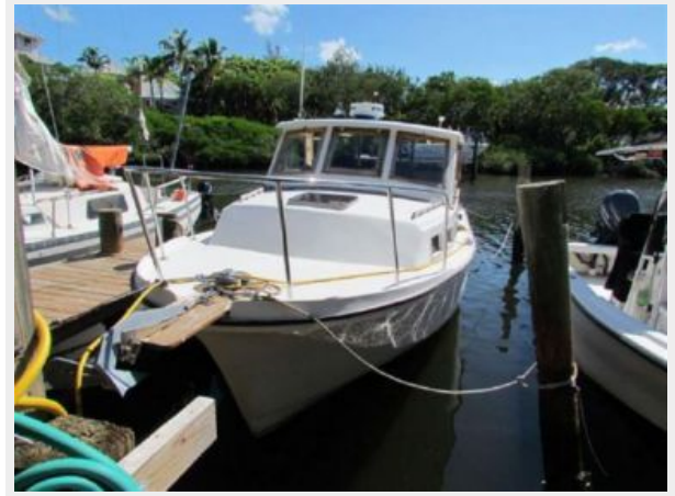
DOCKSIDE, PORT BOW QUARTER