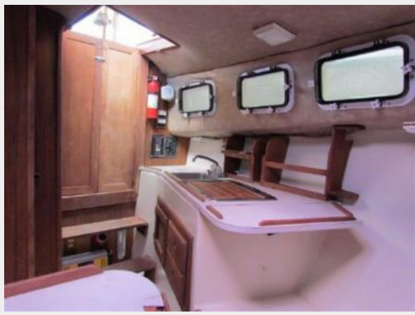
CABIN LOOKING AFT- PORT