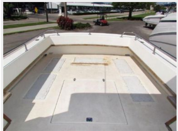
LARGE COCKPIT W/EXCELLENT STORAGE