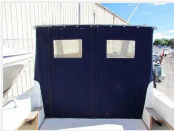
PILOT HOUSE AFT CURTAINS