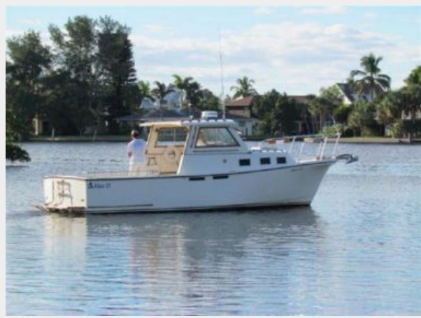
STARBOARD STERN QUARTER