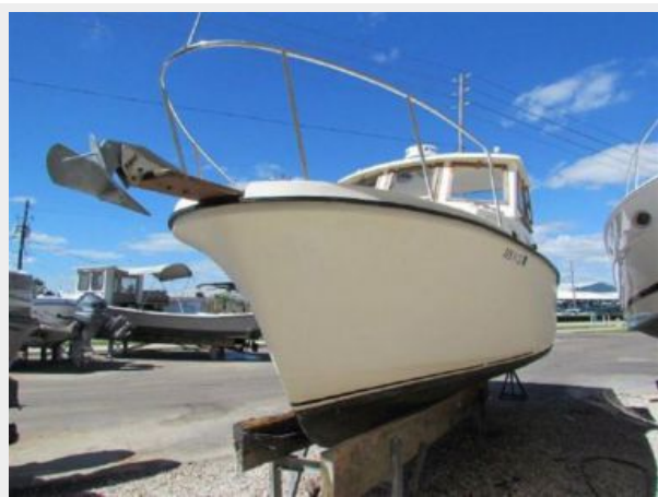
PORT SIDE BOW- HAULED