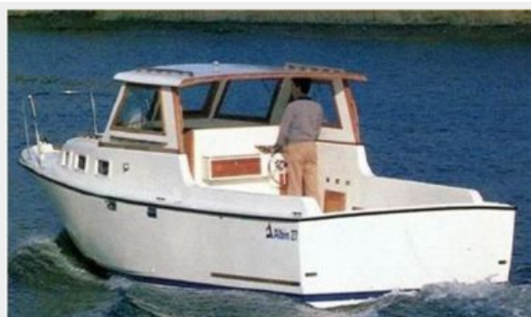
ALBIN 27 SPORT CRUISER