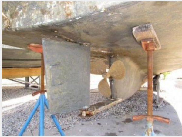
RUDDER 3 BLADE PROP