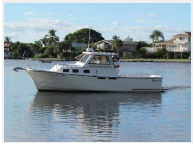
PORT SIDE PROFILE