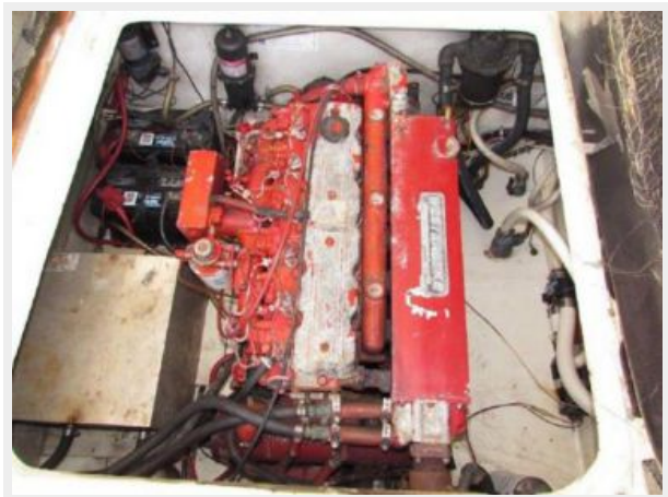
WESTERBEKE 100 HP DIESEL