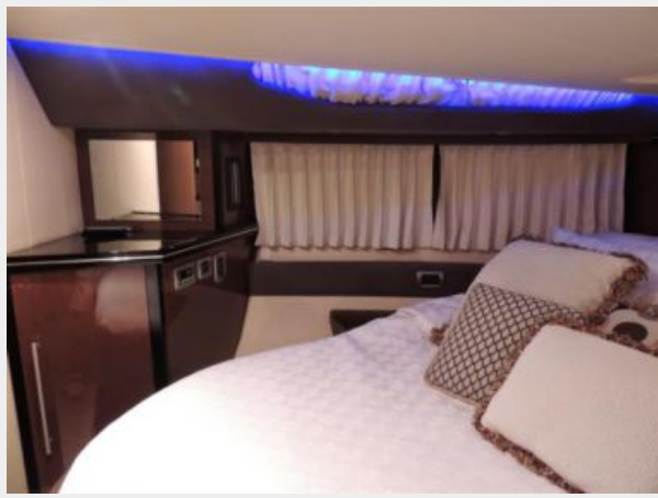
Master to Port