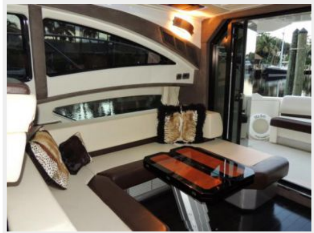
Portside Retractable TV