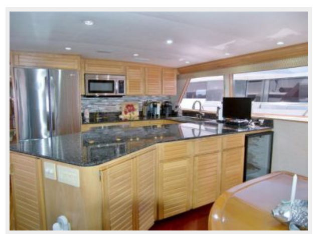
Galley Looking Forward