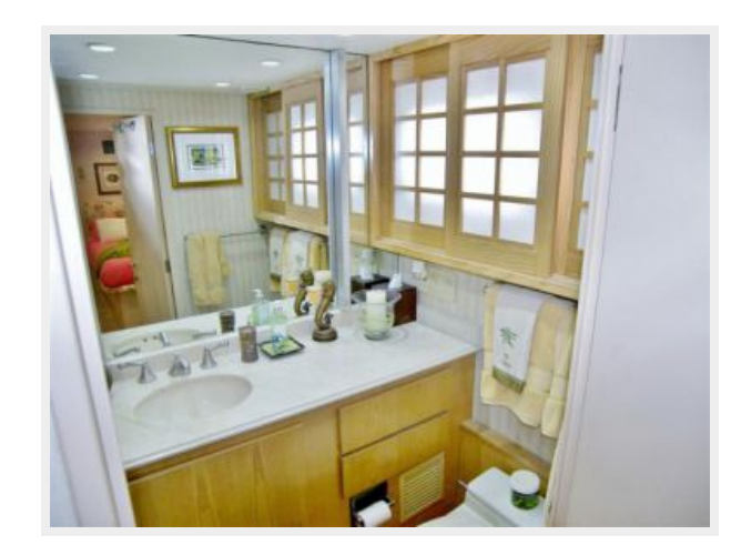
Guest Head 2