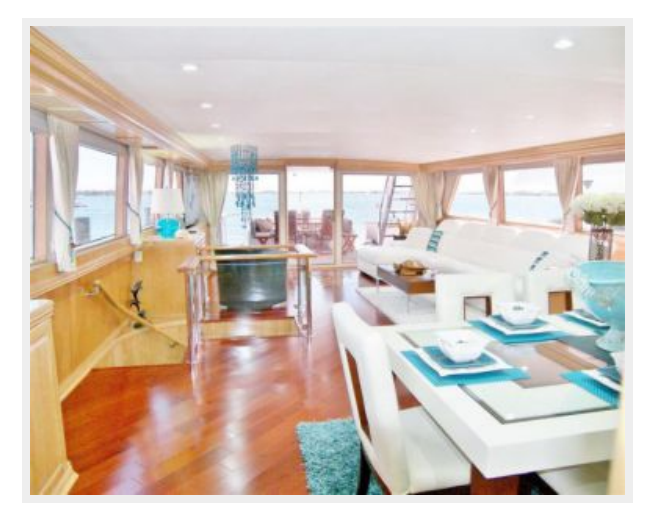
On Deck Powder Room