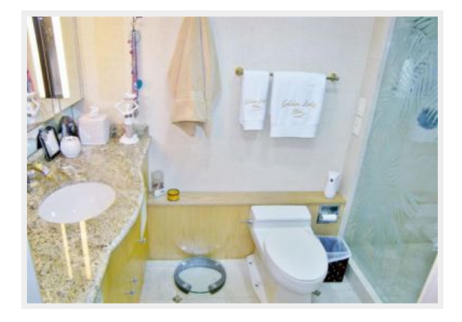
Master Head on Port