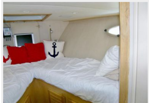
Crew Forward Stateroom