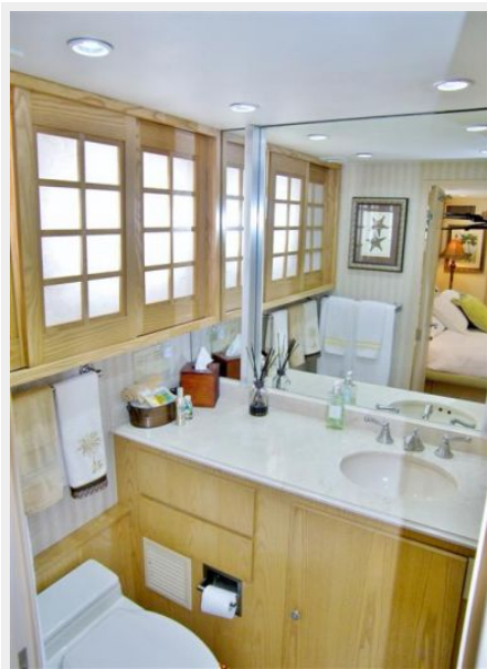
Guest Head 1