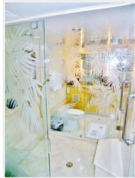
Master Shower View to Stbd.