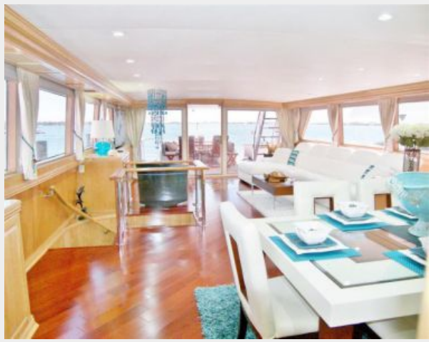
Salon Looking aft from Stbd Hallway