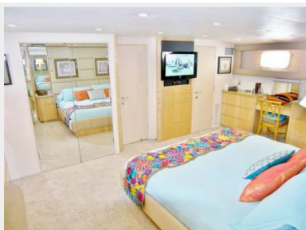
Master to Port with Vanity, TV and Closets