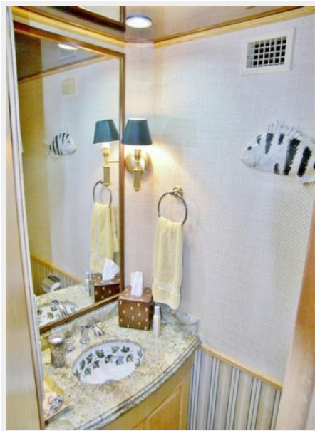
On Deck Powder Room