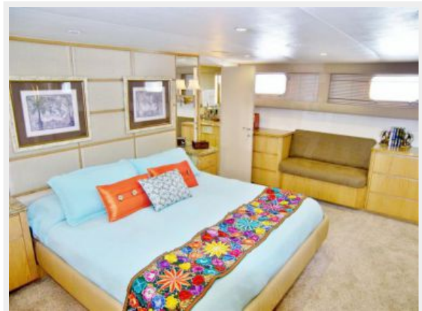
Master to Stbd with Lounge