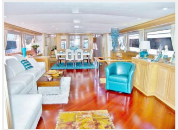
Entry from Aft Deck