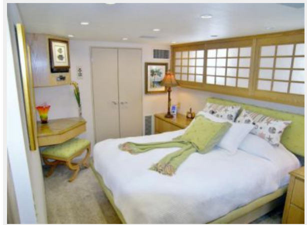
Guest Queen Berth Stateroom