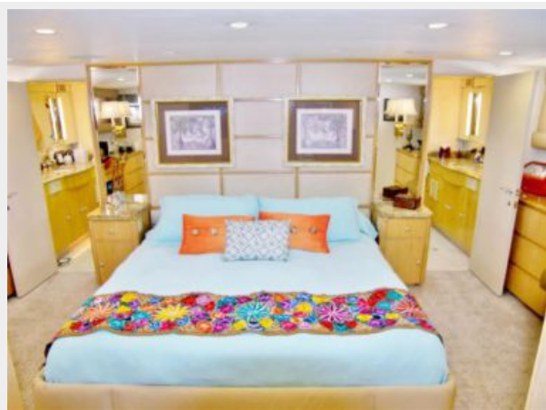
Master Stateroom with His & Hers Heads