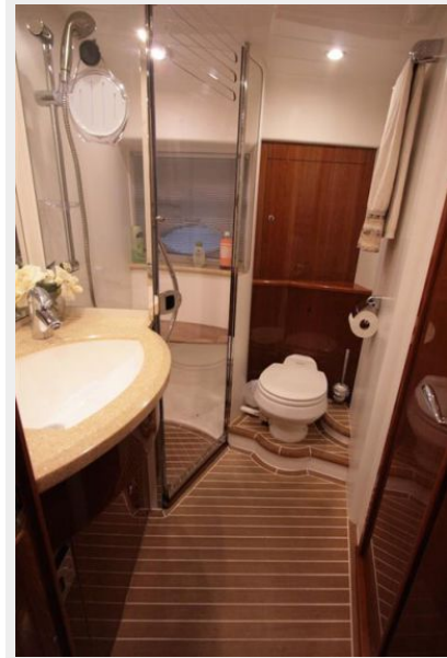
VIP Ensuite Head