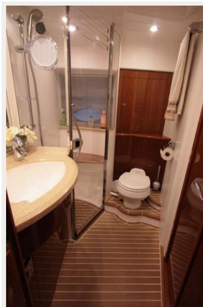
VIP Ensuite Head