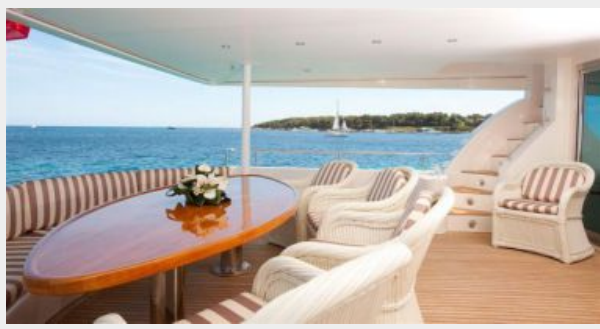
Supertoy aft deck al fresco dining