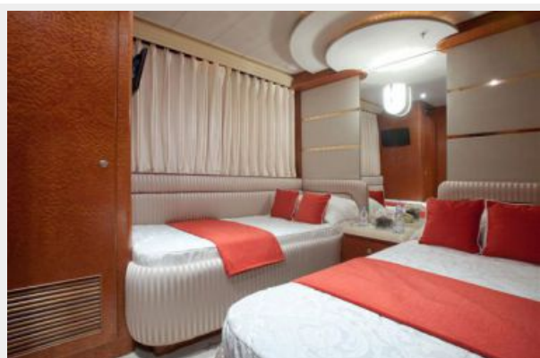
Supertoy VIP guest - twin beds