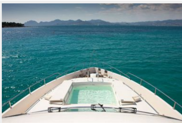
Supertoy splash pool