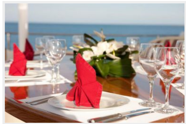
Supertoy al fresco dining