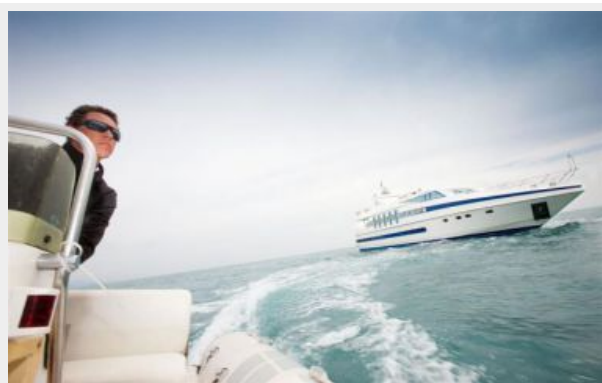
Supertoy toys galore!