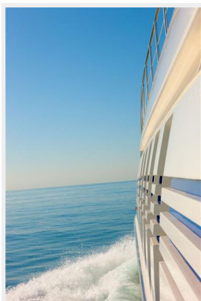
Supertoy side deck