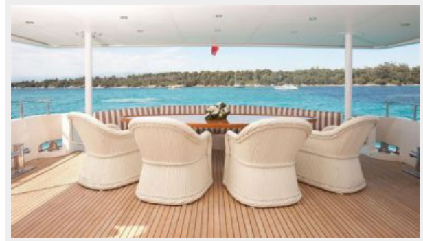
Supertoy aft deck and cockpit