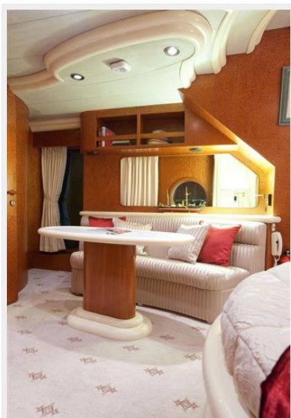
Supertoy owners suite