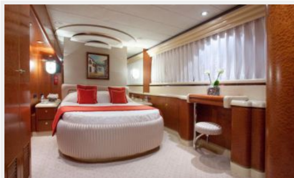
Supertoy VIP guest