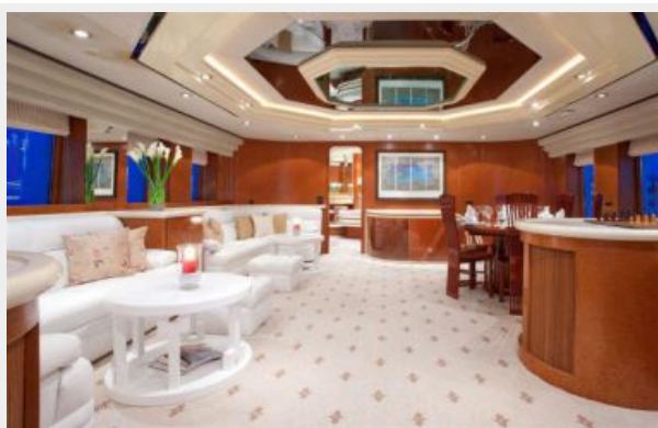
Supertoy main saloon