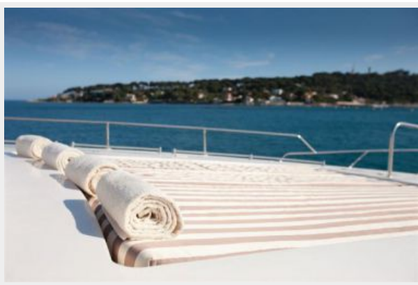
Supertoy sun worshippers deck