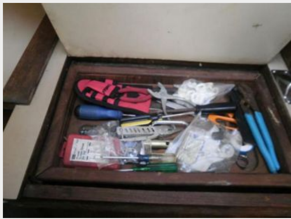
Tool Box Under Steps