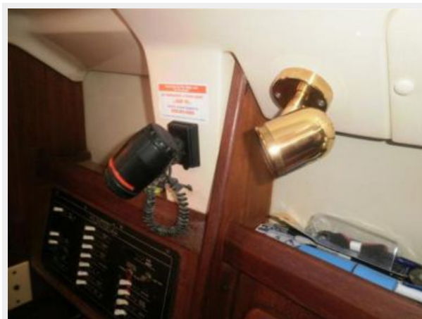
New Light Fixtures Throughout Cabin