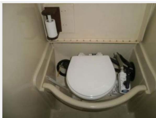
Head w/Lid in raised position