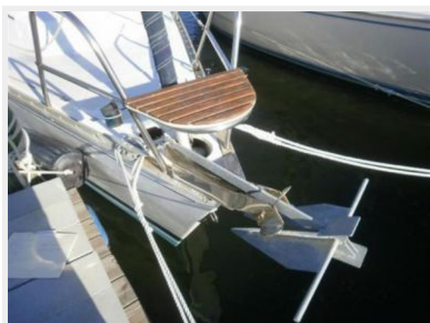
Bow Anchor & Roller