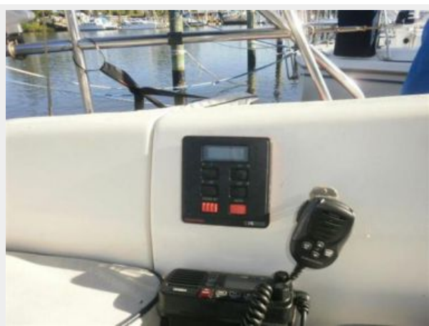
VHF Radio & Autohelm Controls