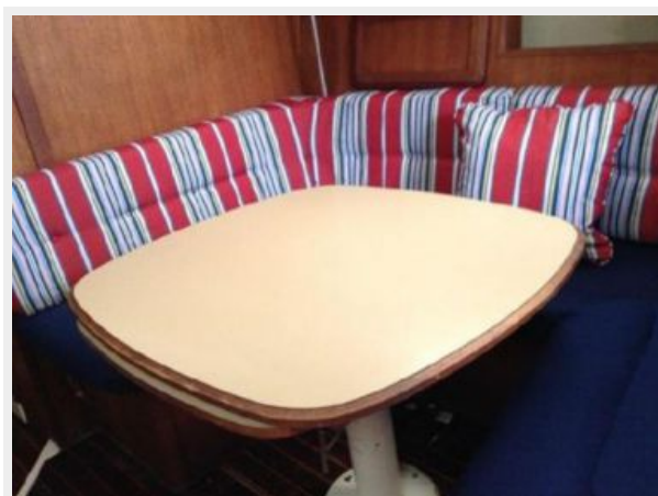
Main Salon Table Converts To A Double Bed