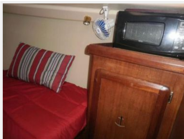
Forward Cabin w/ 2 Storage Lockers