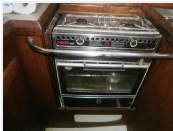
2-Burner w/Stove Origio Stove