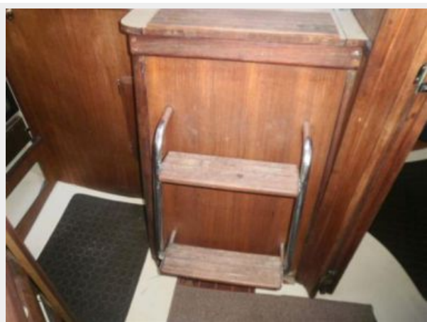
Two Steps into Main Salon