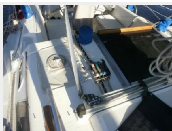
All Lines Lead to Cockpit w/Stoppers