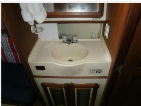
Bath Vanity Across From Head w/Shower