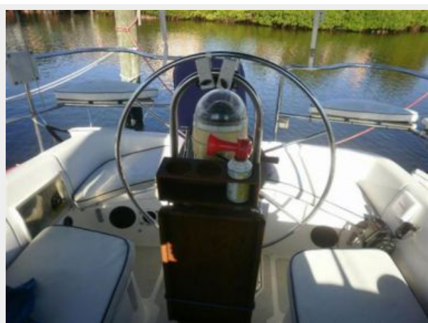
Fold down Table in Cockpit