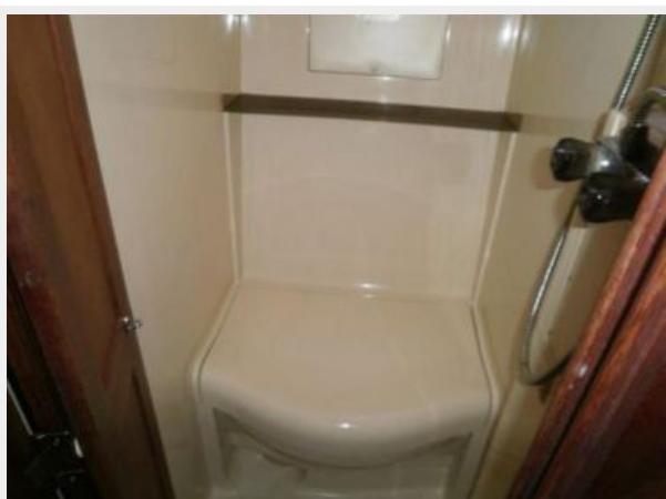
Head w/Lid Down and Shower to Right