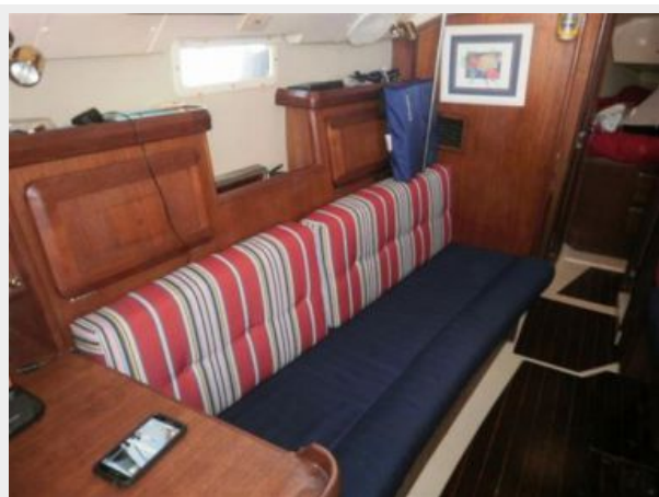
Looking Forward Portside Main Salon