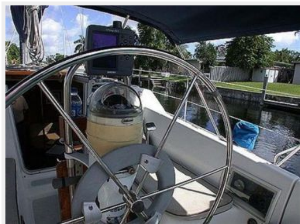
Destroyer Wheel & AutoPilot