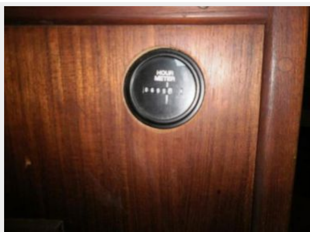
690 Hrs On Hobb Meter (installed 1999)