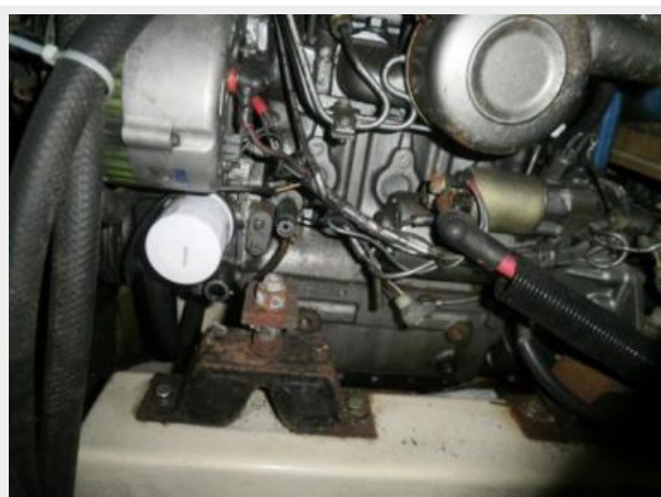
27HP Yanmar 3GM30