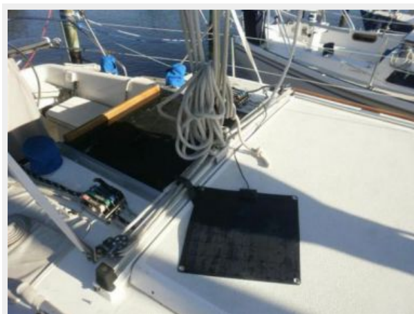
Small Solar Panel Keeps Batteries Topped off