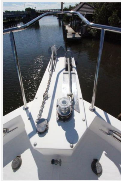
Dual Anchor Pulpit