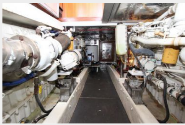
Engine Room Forward