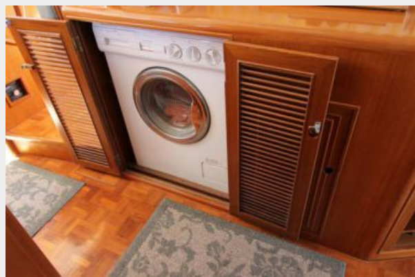
Washer & Dryer