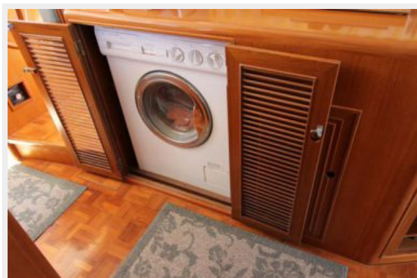
Washer & Dryer