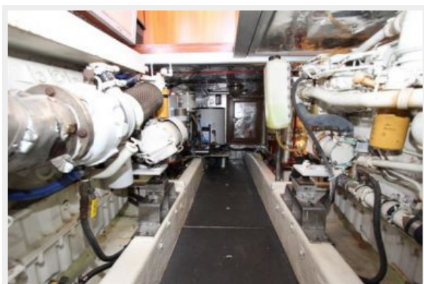
Engine Room Forward