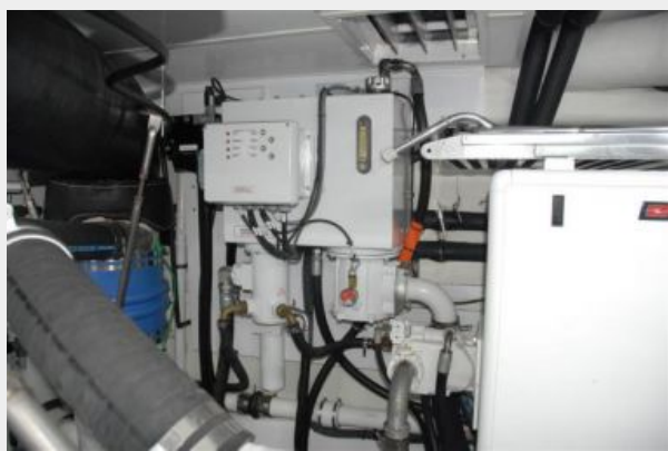
Zero Speed Stabilizers