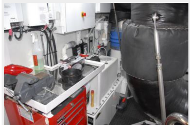
Waste Treatment Plant