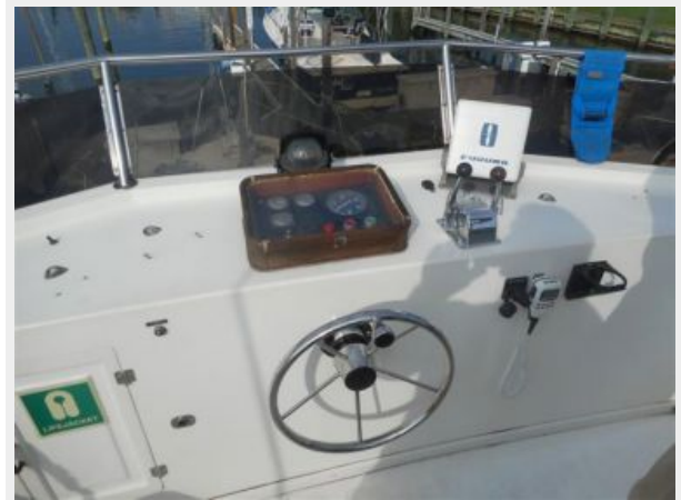
36' Marine Trader flybridge forward