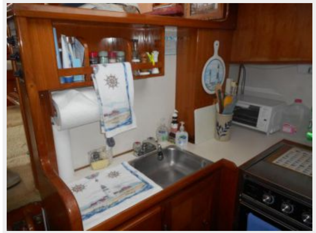
36' Marine Trader galley