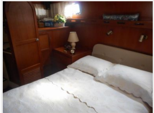
36' Marine Trader master stateroom starboard