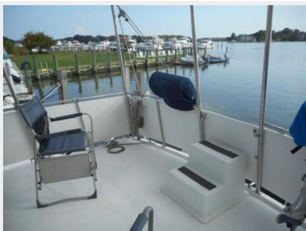
36' Marine Trader sundeck starboard