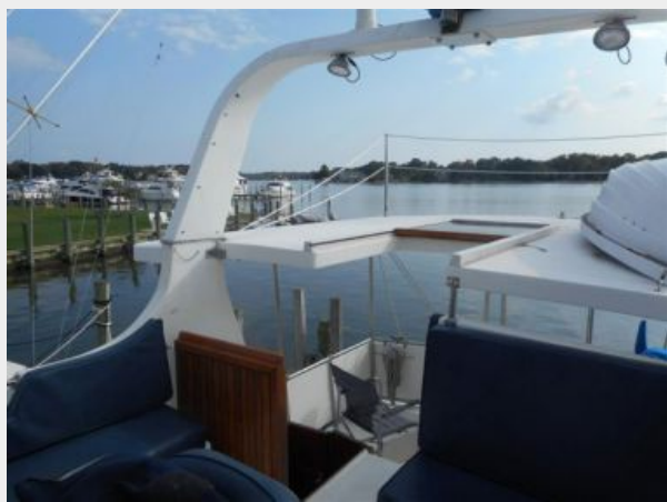
36' Marine Trader flybridge aft