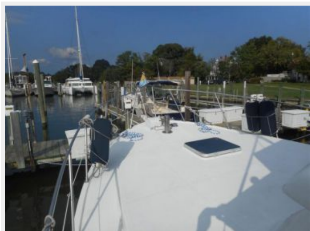
36' Marine Trader foredeck