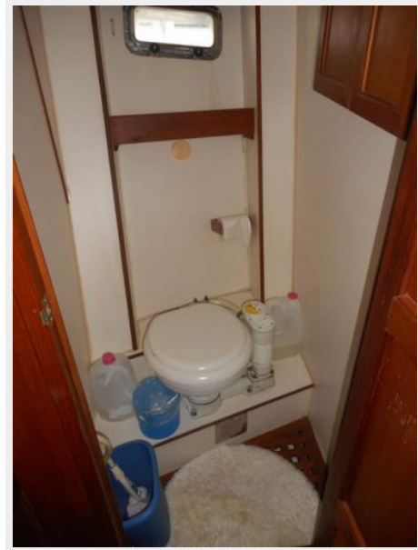
36' Marine Trader guest head