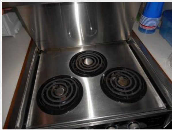
36' Marine Trader galley cooktop