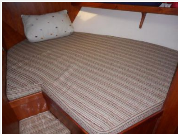
36' Marine Trader guest stateroom