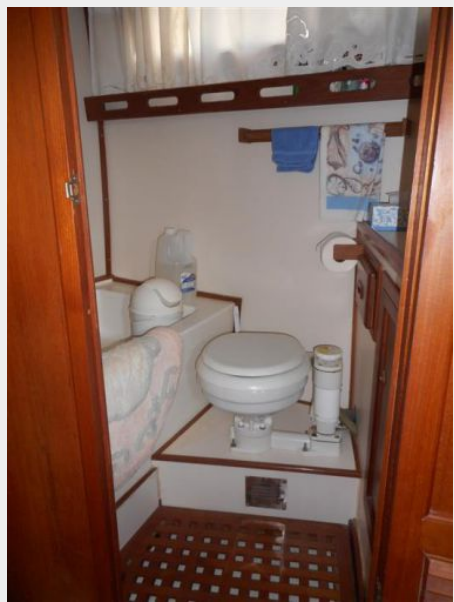
36' Marine Trader master stateroom head