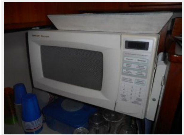
36' Marine Trader galley microwave oven