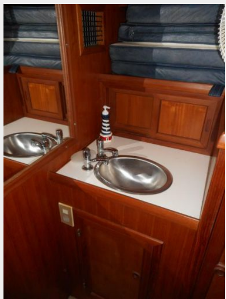
36' Marine Trader guest head sink