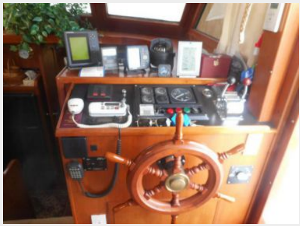
36' Marine Trader lower helm