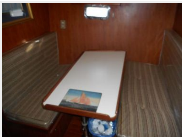
36' Marine Trader dinette