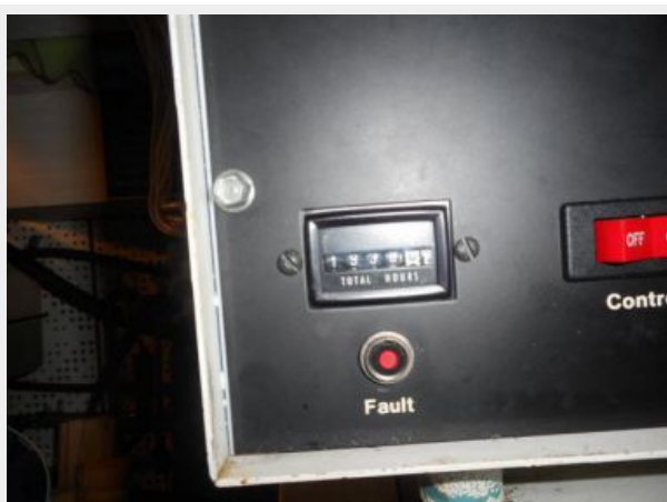
36' Marine Trader generator hour meter