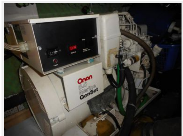
36' Marine Trader generator