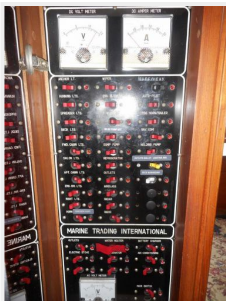
36' Marine Trader electrical panel