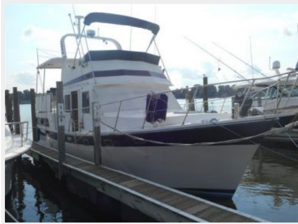
36' Marine Trader starboard forward profile