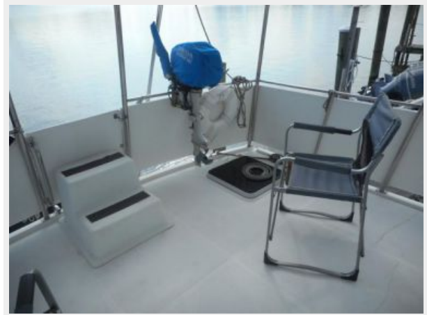
36' Marine Trader sundeck port