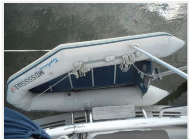
36' Marine Trader tender