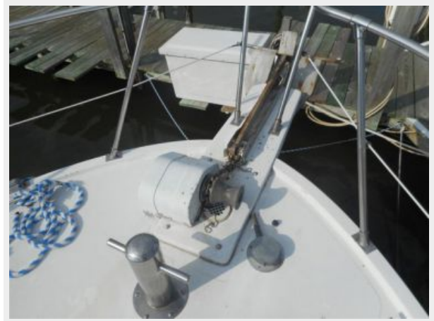
36' Marine Trader anchor windlass