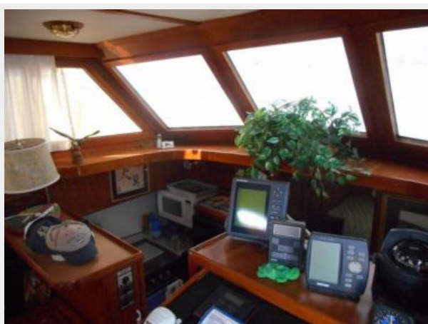
36' Marine Trader salon forward