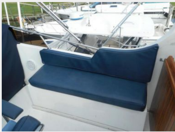
36' Marine Trader flybridge starboard seating