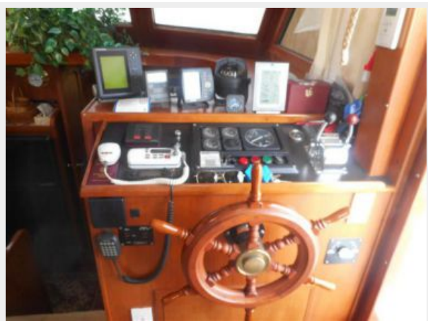
36' Marine Trader lower helm