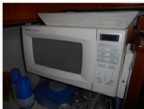
36' Marine Trader galley microwave oven