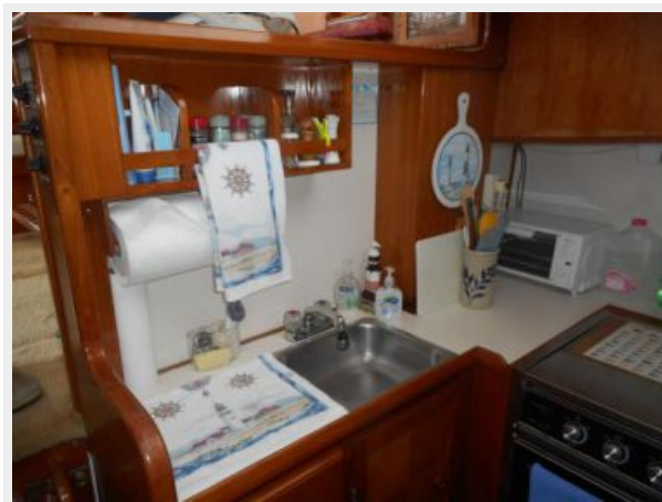
36' Marine Trader galley