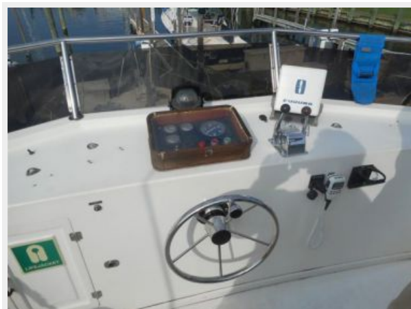
36' Marine Trader flybridge forward