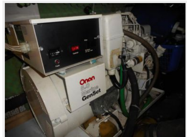
36' Marine Trader generator