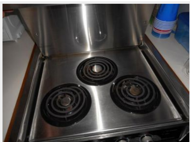
36' Marine Trader galley cooktop