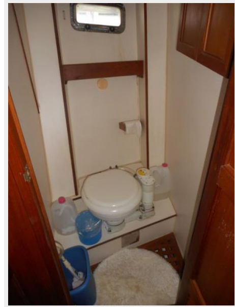
36' Marine Trader guest head