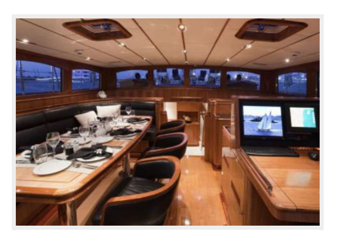
This is Us Deckhouse