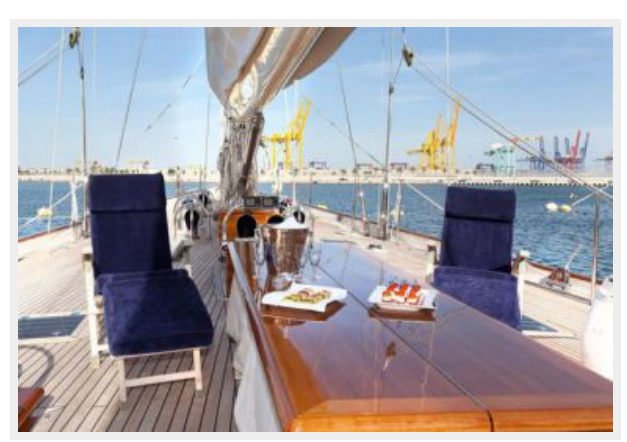
This is Us Deck