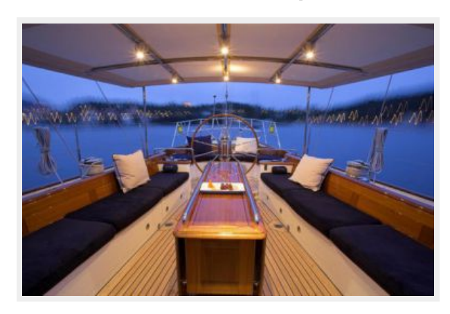
This is Us Cockpit