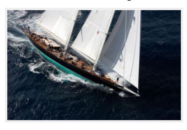
This is Us sailing