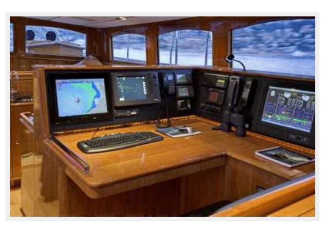
This is Us Navigation