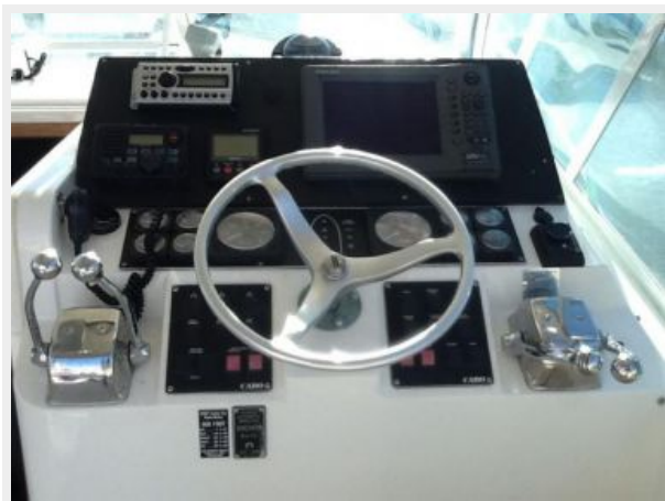
Helm / Electronics & Navigation 1