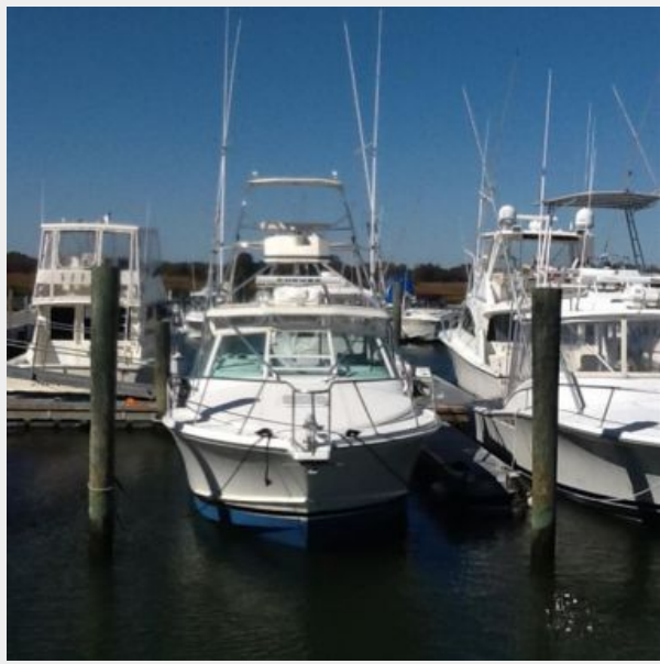
Profile 2 - Bow