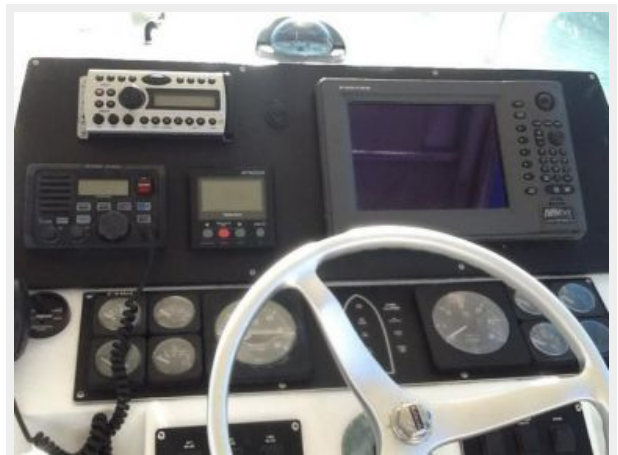
Helm / Electronics & Navigation 2