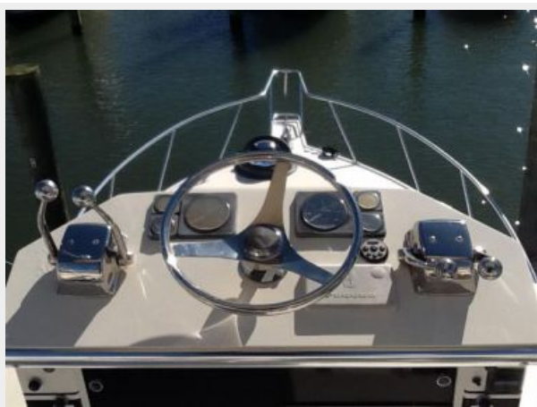
Helm / Electronics & Navigation 3 - Tower Electronics