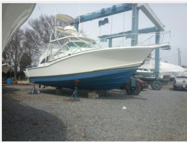
Profile 4 - Starboard