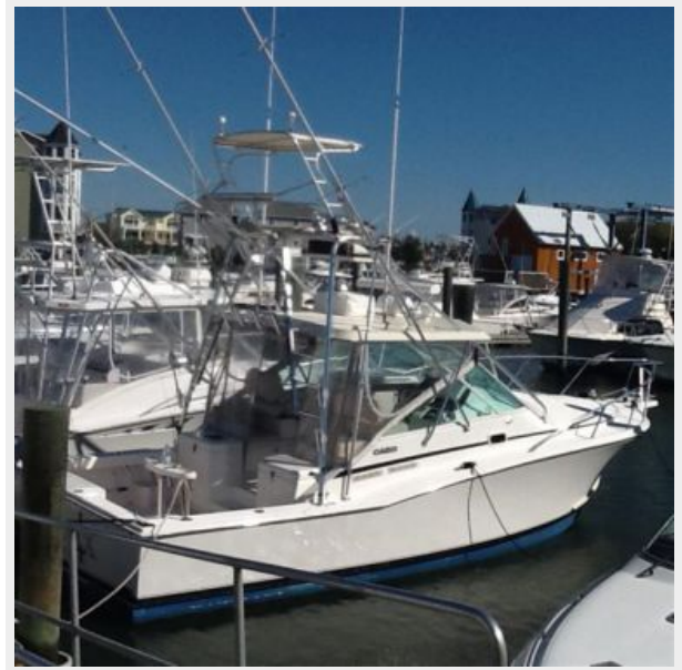
Profile 3 - Starboard