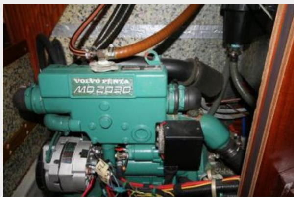
Side view of engine, showing access