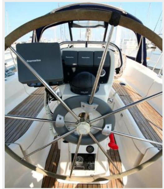
View of side deck