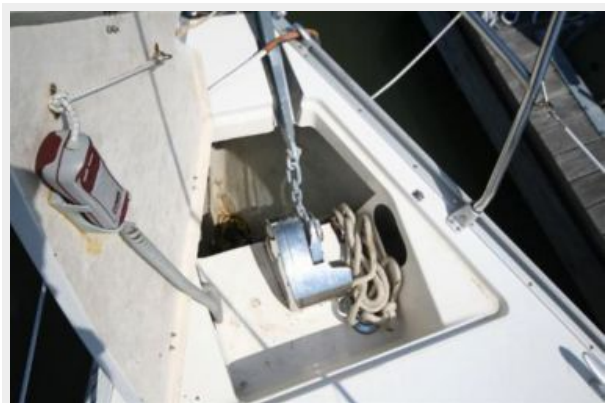
Anchor locker and ground tackle