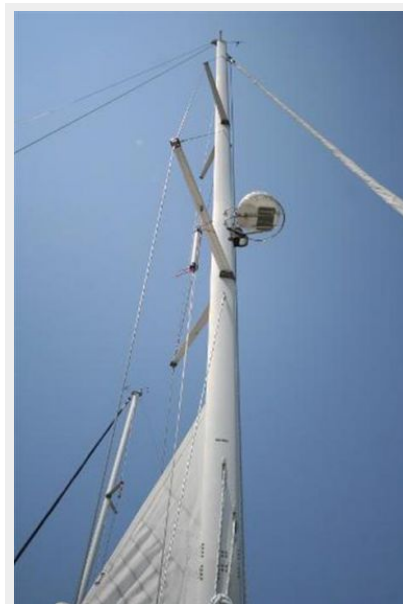
Mast with Radome