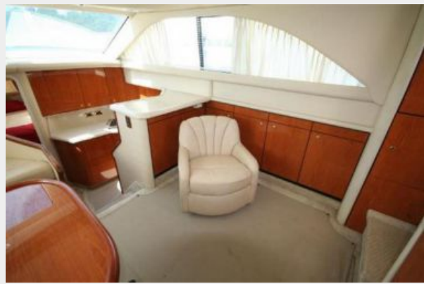
Fwd starboard of salon, behind galley