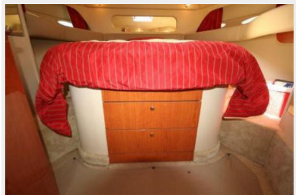
Storage drawers under forward berth