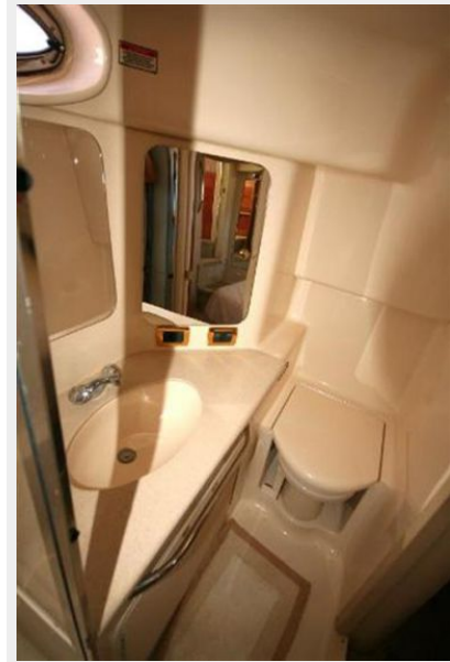
Aft head and vanity