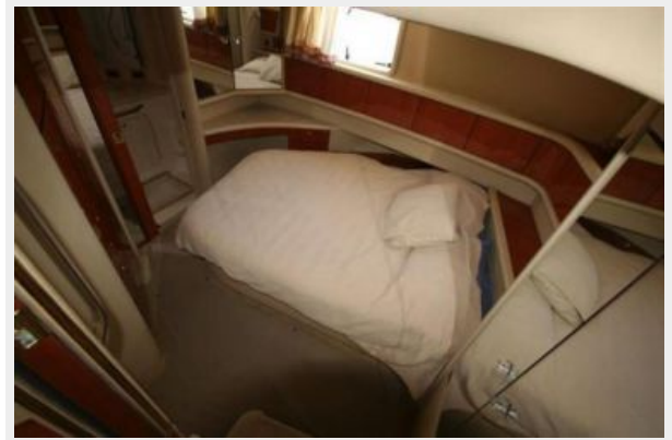
Aft cabin, en suite