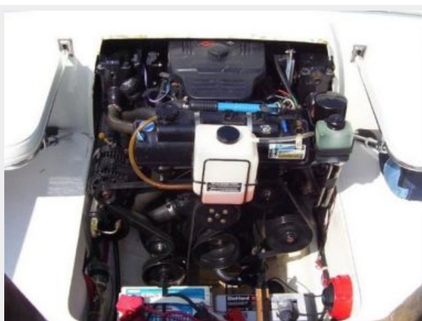
Mercuriser 5.7L Horizon- freshwater cooling