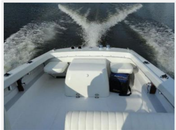
looking aft underway