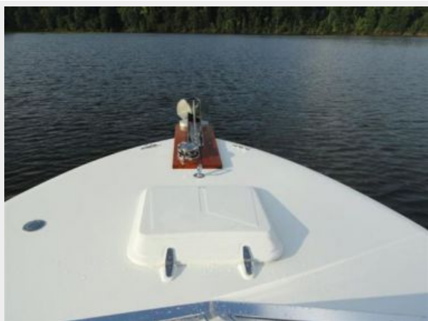
bow with SL windlass