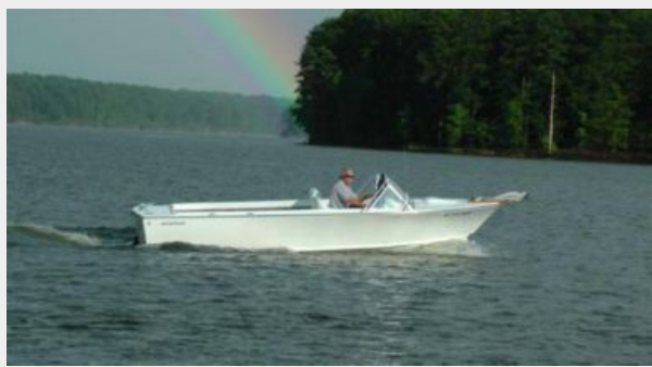
happy Bertie day