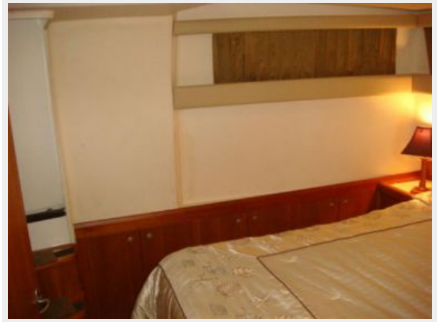
43' Mainship master stateroom aft