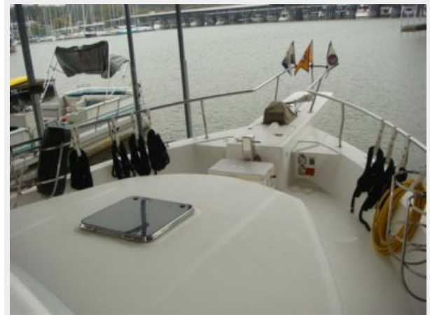
43' Mainship port side deck photo1