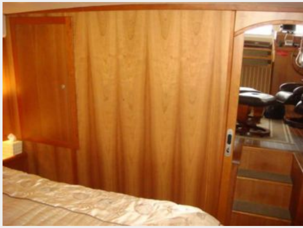
43' Mainship master stateroom forward