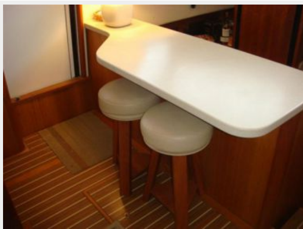
43' Mainship salon port forward