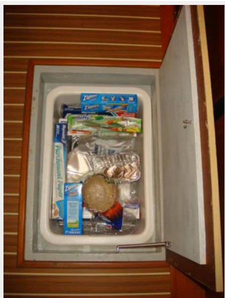
43' Mainship galley under sole storage