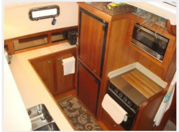
43' Mainship galley photo1