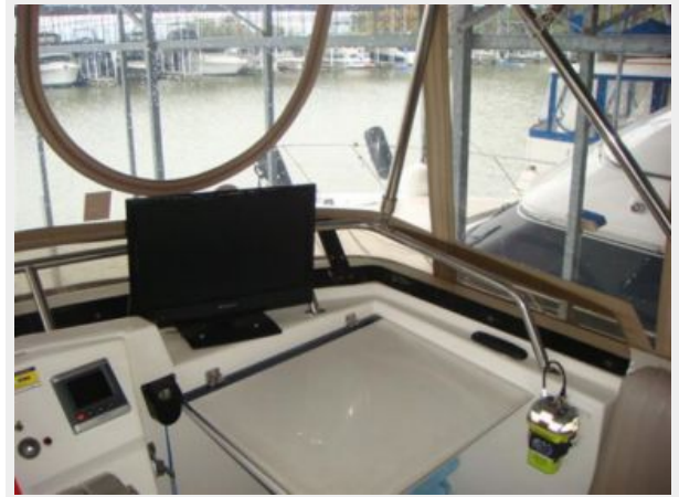
43' Mainship flybridge starboard forward