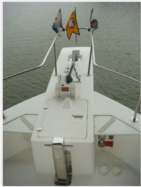
43' Mainship anchor windlass