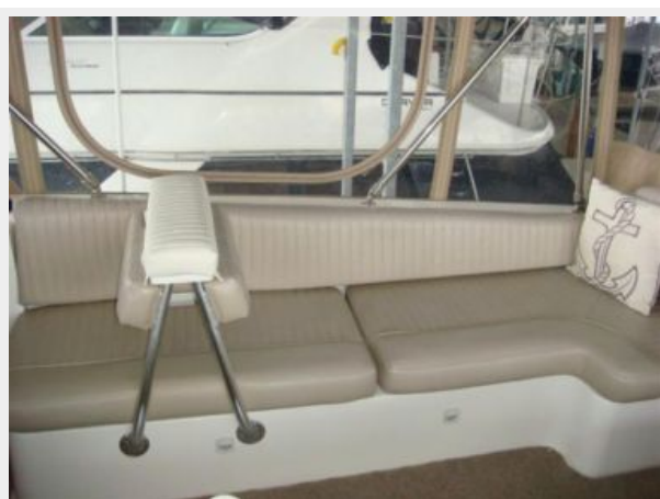
43' Mainship flybridge starboard seating