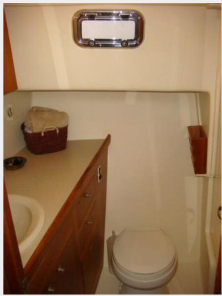
43' Mainship guest head