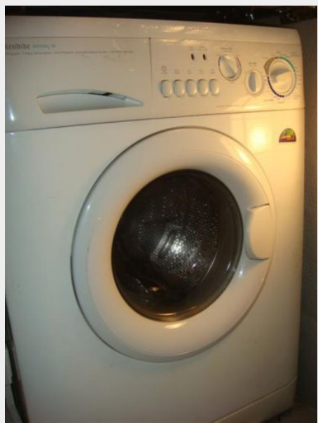
43' Mainship washer-dryer