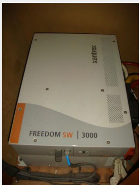
43' Mainship inverter