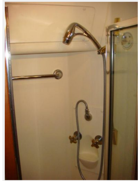
43' Mainship guest shower