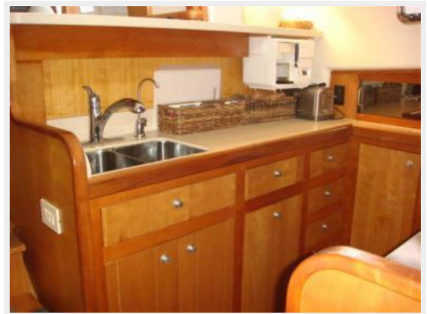
43' Mainship galley photo3