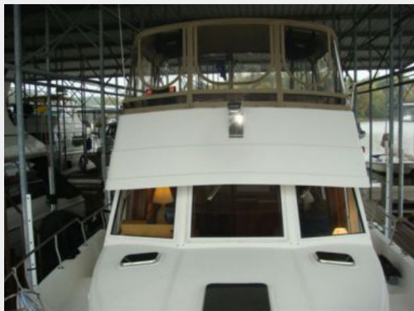
43' Mainship foredeck aft