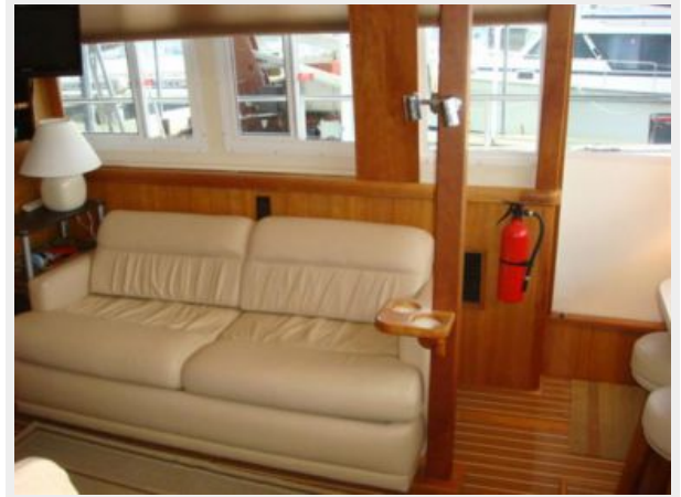
43' Mainship salon port