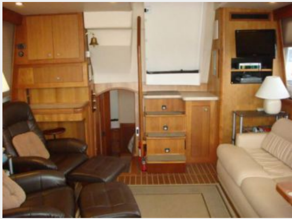
43' Mainship salon aft