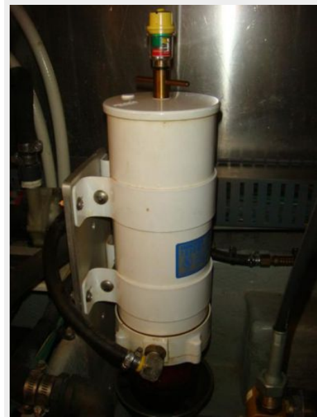
43' Mainship starboard Racor fuel filter