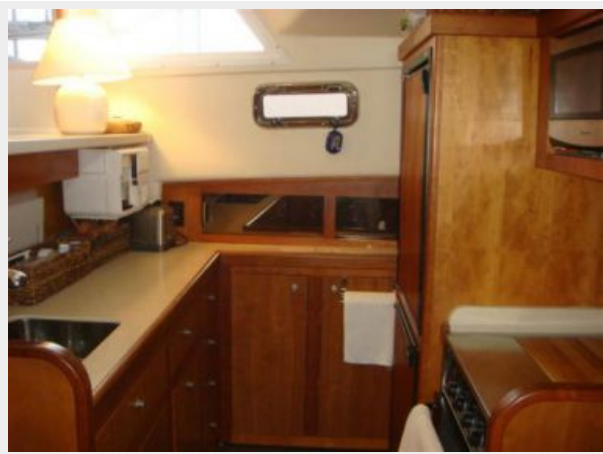
43' Mainship galley photo2