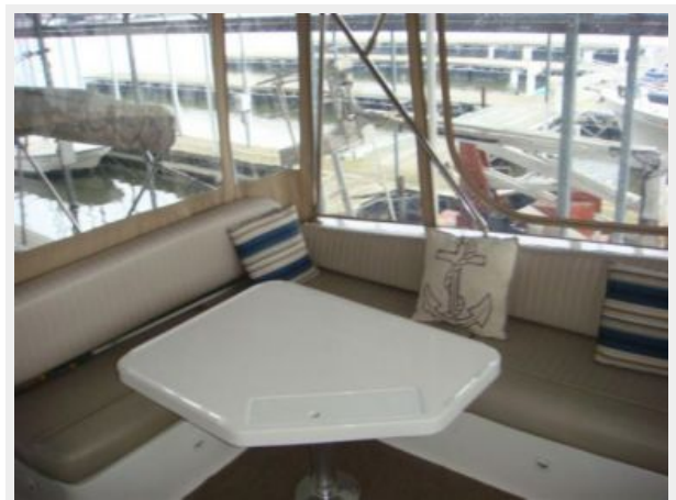
43' Mainship flybridge port seating