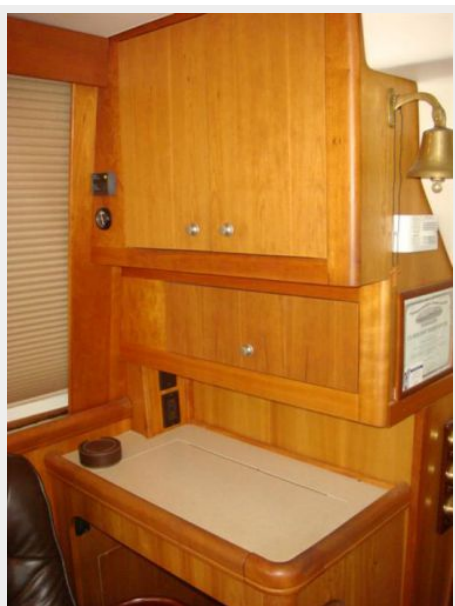
43' Mainship salon starboard aft