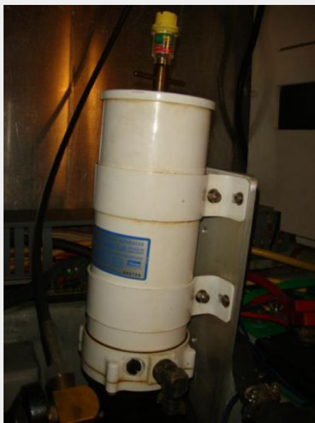
43' Mainship port Racor fuel filter