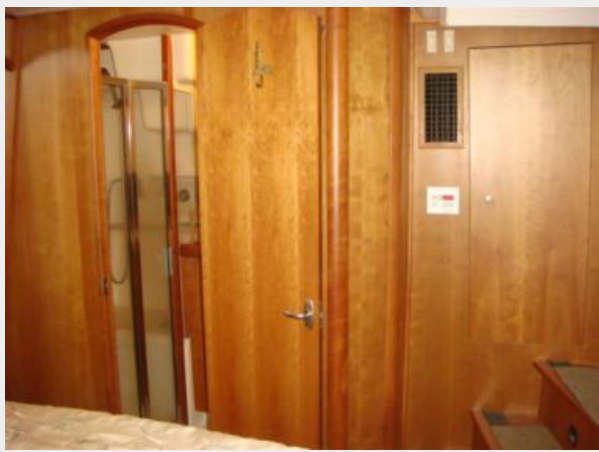
43' Mainship master stateroom starboard