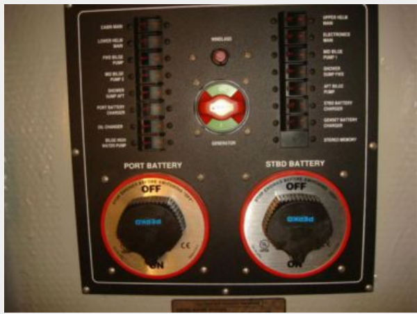
43' Mainship electrical panel2