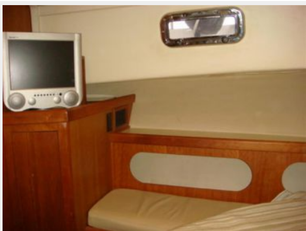
43' Mainship guest stateroom port