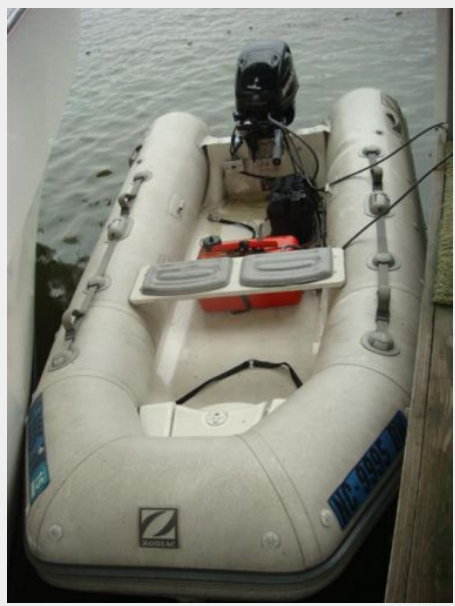
43' Mainship tender