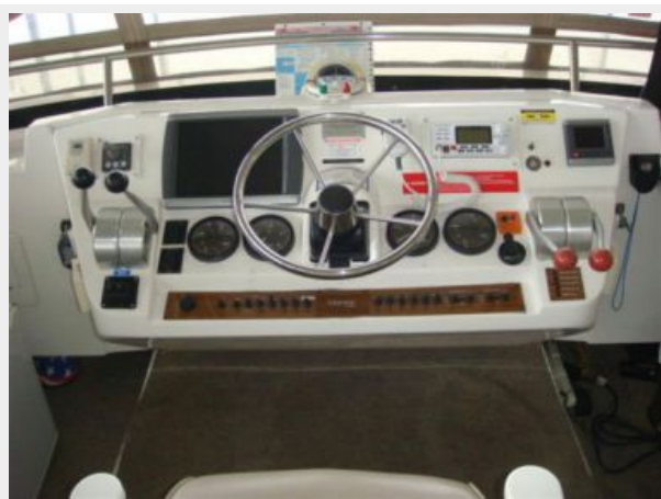
43' Mainship flybridge helm