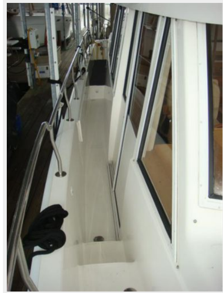
43' Mainship starboard side deck photo1