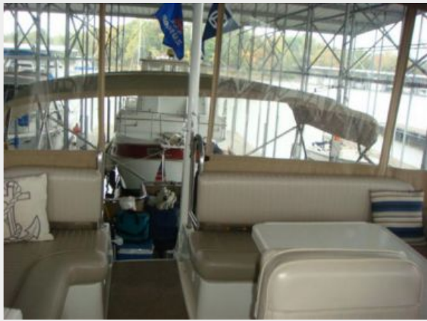
43' Mainship flybridge aft