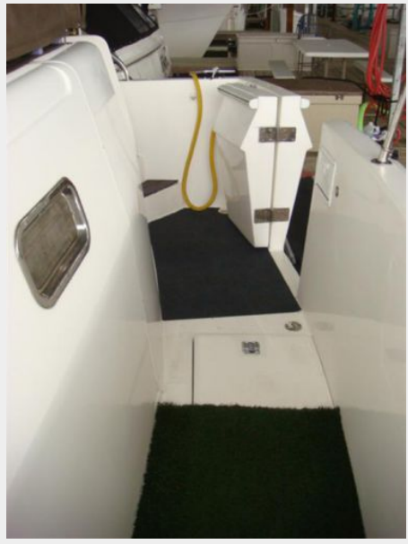
43' Mainship cockpit starboard