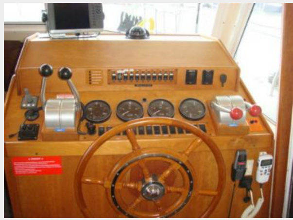
43' Mainship lower helm photo2