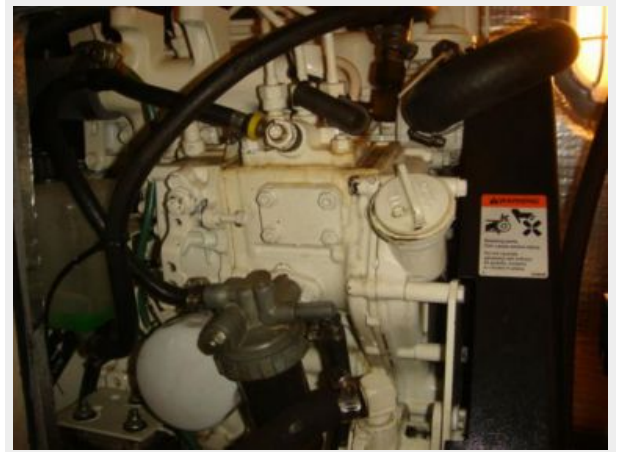
43' Mainship generator