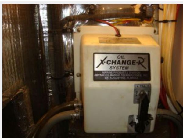
43' Mainship oil change system