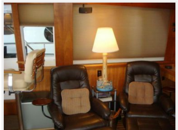
43' Mainship salon starboard