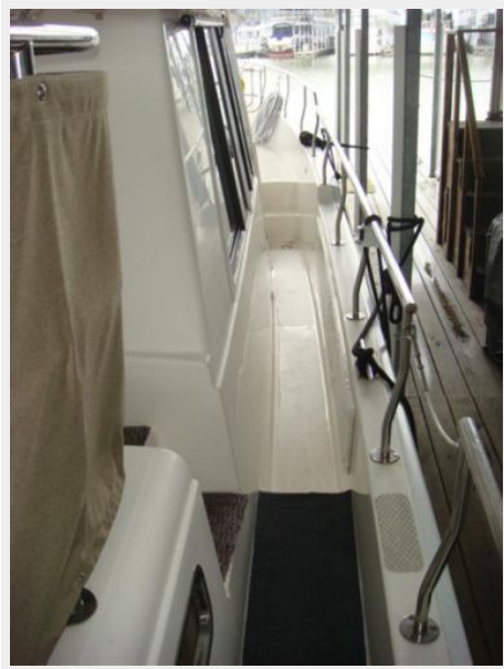
43' Mainship starboard side deck photo2