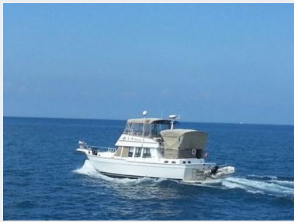
43' Mainship underway