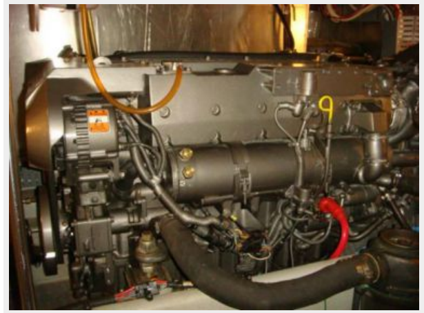
43' Mainship starboard main engine