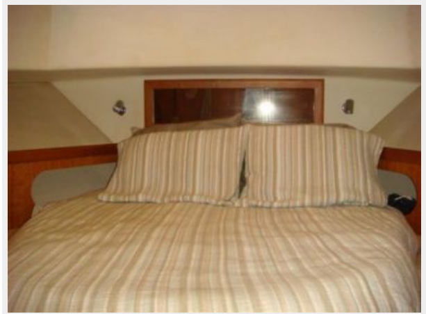
43' Mainship guest stateroom