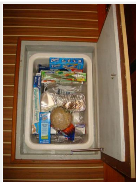
43' Mainship galley under sole storage