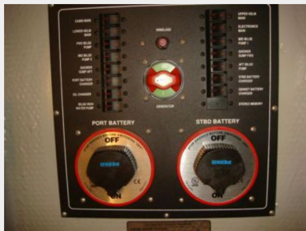
43' Mainship electrical panel2