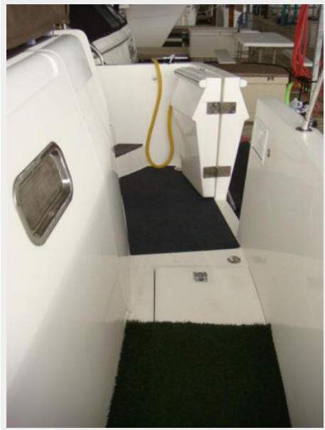
43' Mainship cockpit starboard