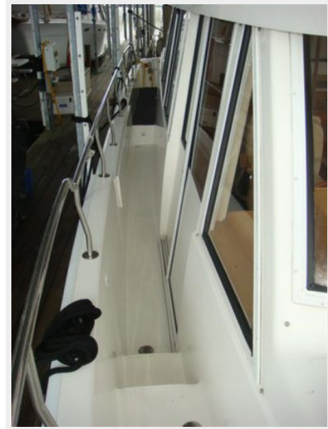
43' Mainship starboard side deck photo1