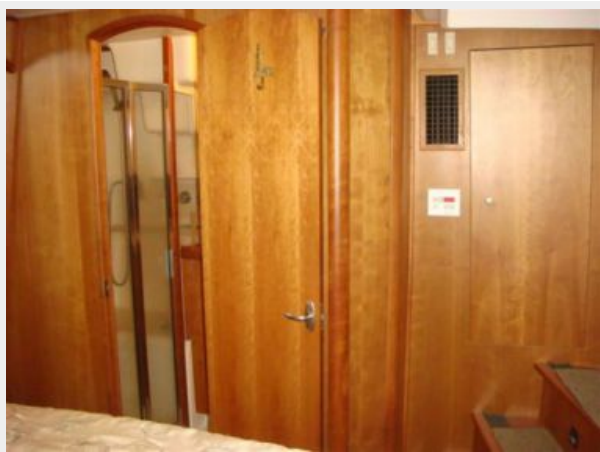
43' Mainship master stateroom starboard