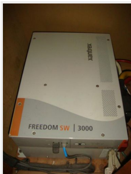
43' Mainship inverter