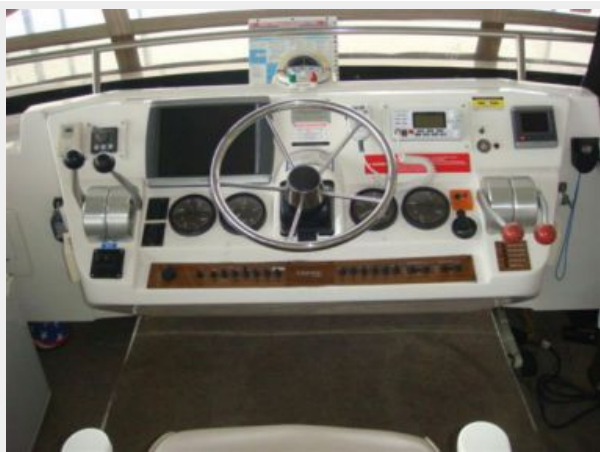
43' Mainship flybridge helm