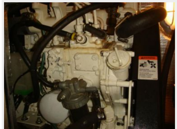
43' Mainship generator