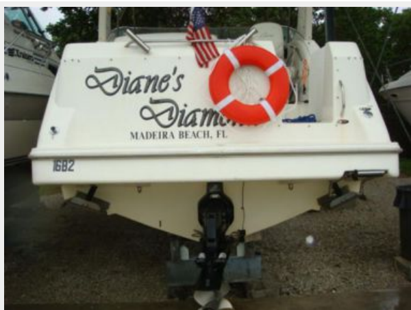
28' Bayliner swimplatform