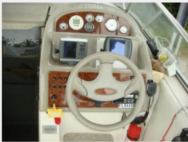
28' Bayliner helm photo2