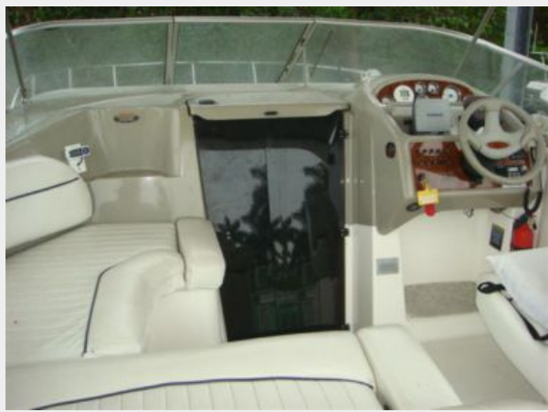
28' Bayliner upper deck forward