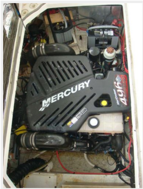
28' Bayliner engine compartment