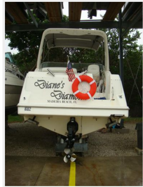
28' Bayliner aft profile