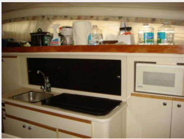
28' Bayliner galley photo1