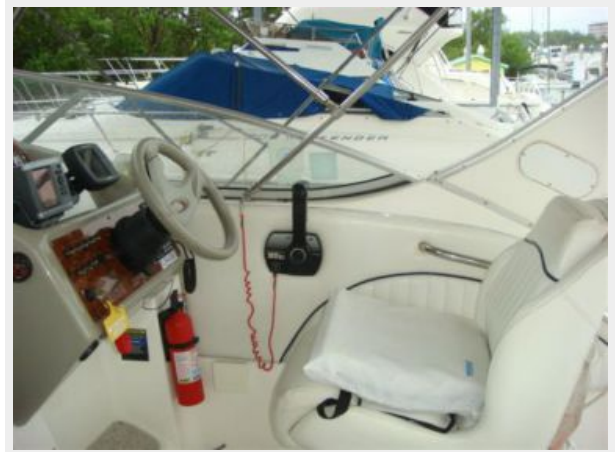
28' Bayliner helm photo1