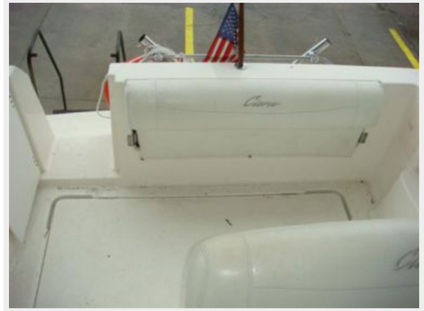
28' Bayliner cockpit forward