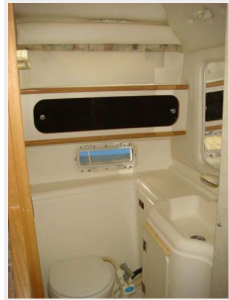
28' Bayliner head