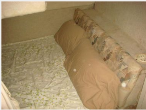
28' Bayliner aft stateroom