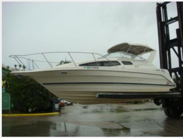
28' Bayliner port profile