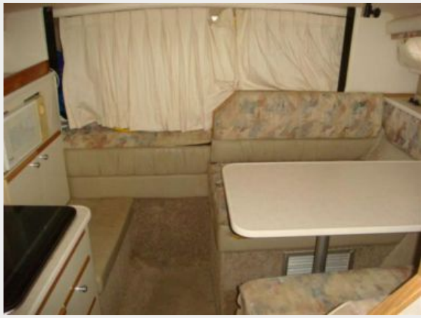
28' Bayliner salon forward