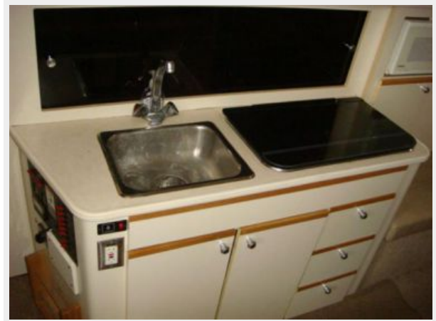
28' Bayliner galley photo2