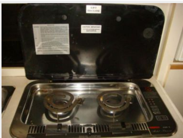
28' Bayliner galley cooktop