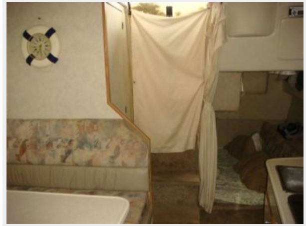
28' Bayliner salon aft