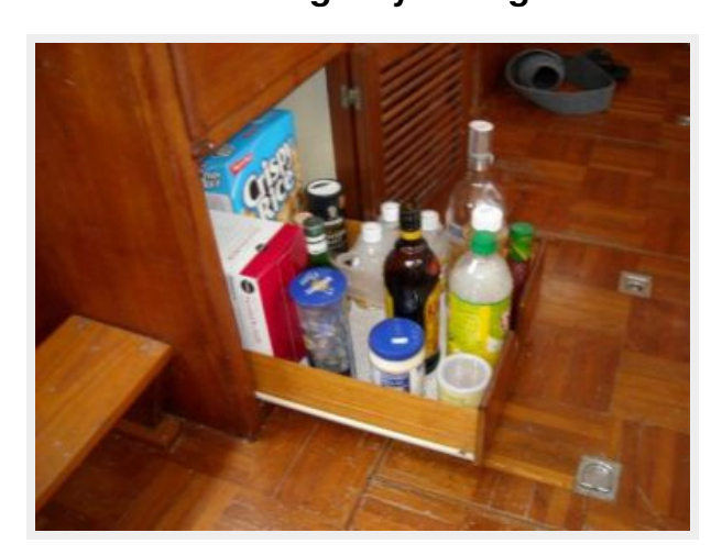
36' Albin galley storage1