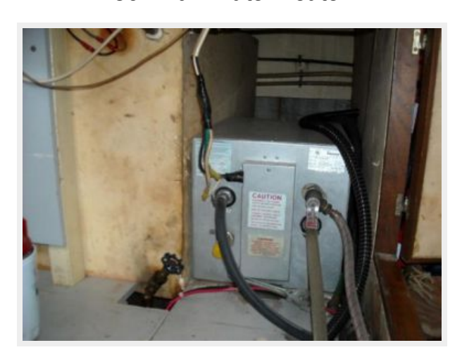
36' Albin water heater