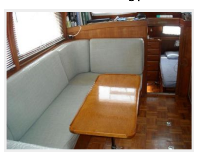
36' Albin salon seating photo2