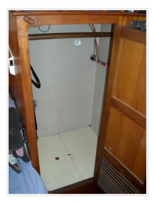
36' Albin master stateroom hanging locker