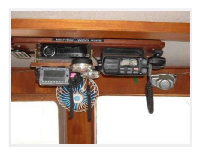
36' Albin lower helm electronics