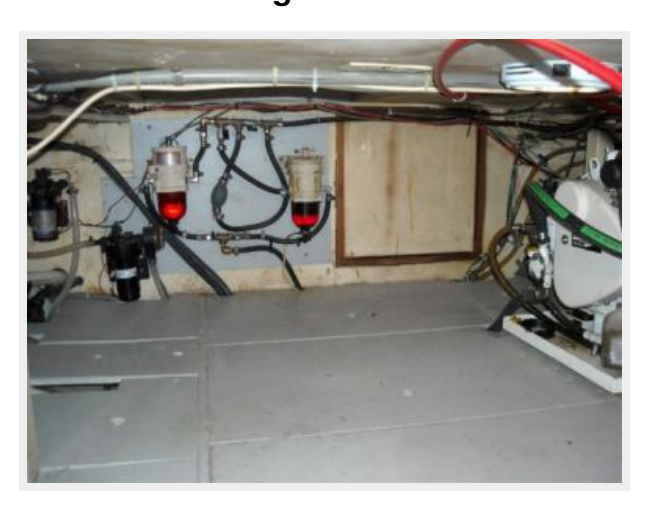
36' Albin engine room forward