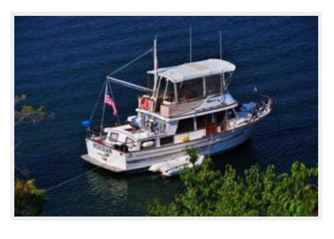
36' Albin starboard aft profile photo1