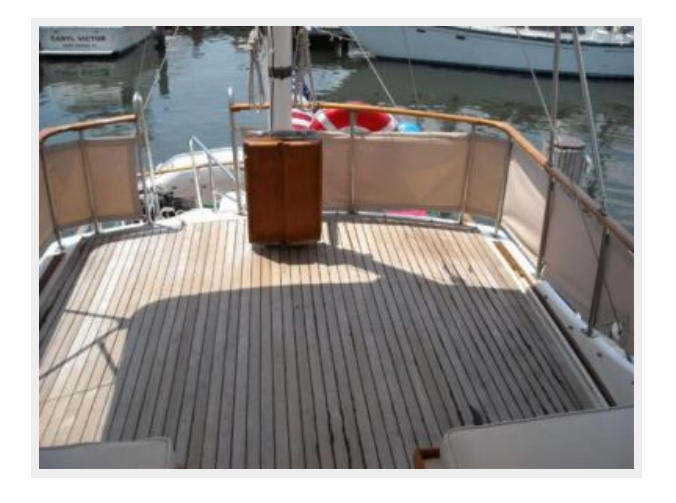
36' Albin flybridge aft