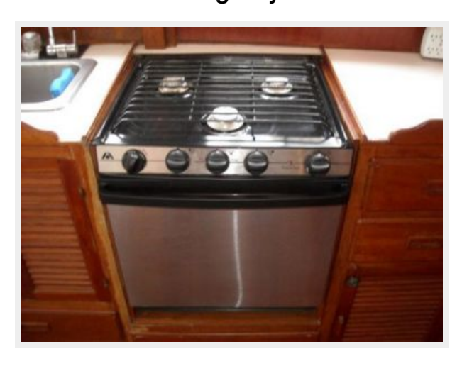
36' Albin galley stove