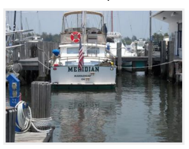
36' Albin aft profile