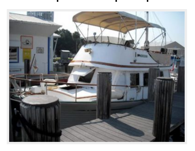
36' Albin port forward profile photo2