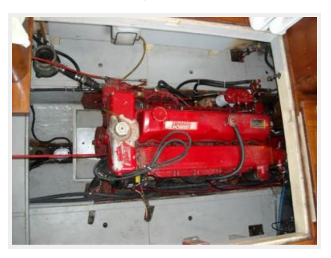
36' Albin engine room access