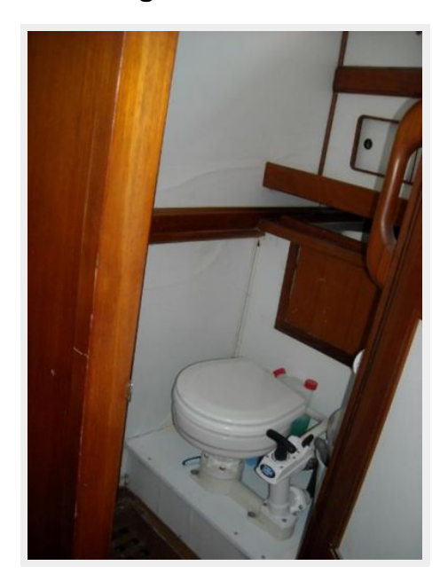
36' Albin guest stateorom head