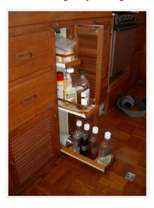
36' Albin galley storage3