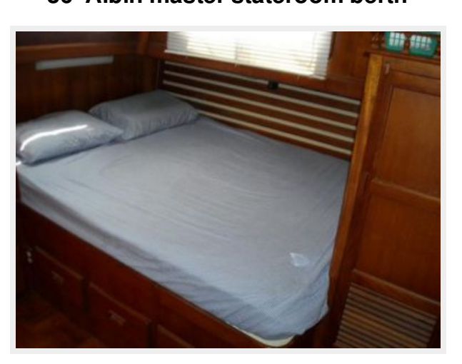
36' Albin master stateroom berth