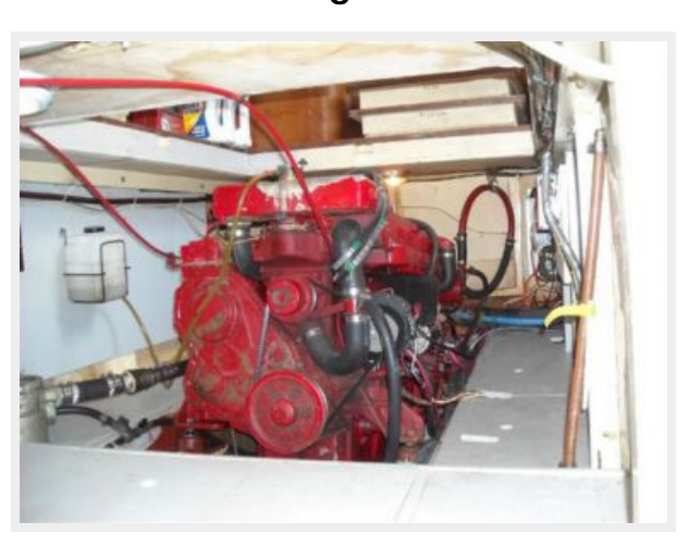
36' Albin engine room aft