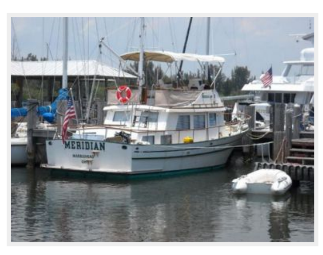
36' Albin starboard aft profile photo2