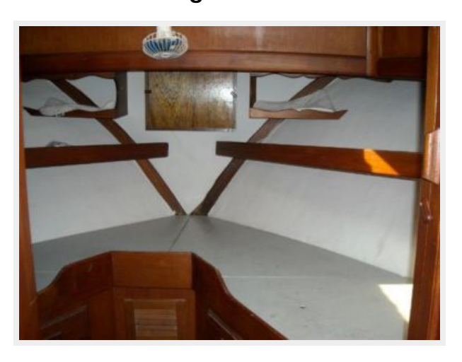
36' Albin guest stateroom