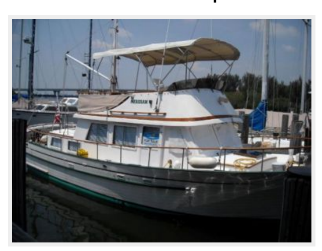
36' Albin starboard profile