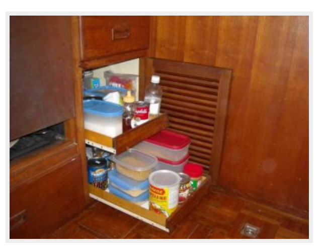
36' Albin galley storage2