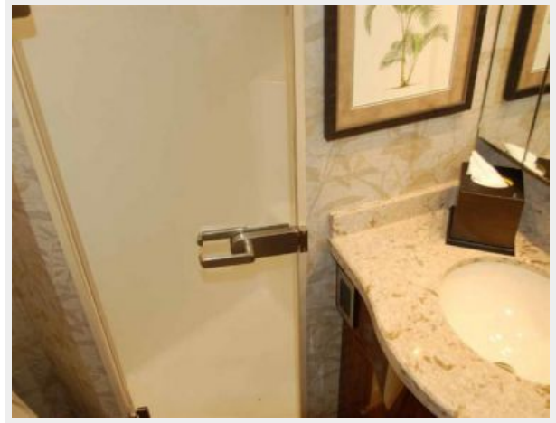
Standard 4 Stateroom