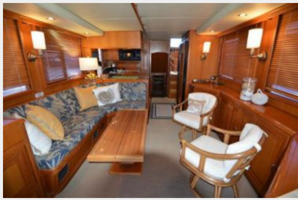
55 Fleming, Warm and Inviting Salon