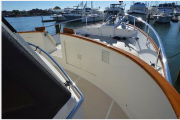
55 Fleming, Stbd Side Looking Forward