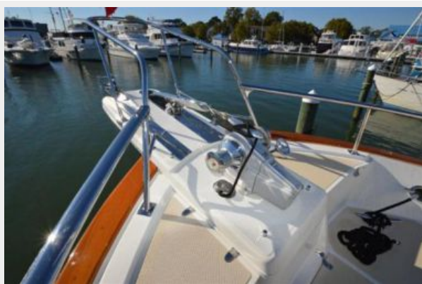
55 Fleming, Anchor Pulpit and Windlass