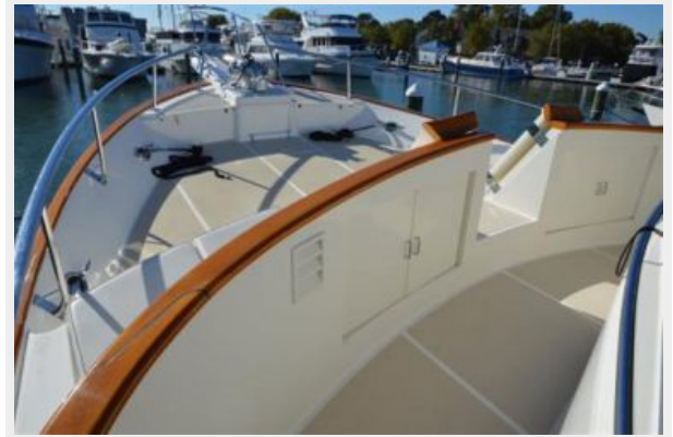
55 Fleming, Port Side Looking Forward