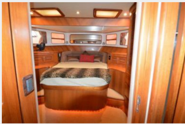
55 Fleming, Beautiful Master Stateroom