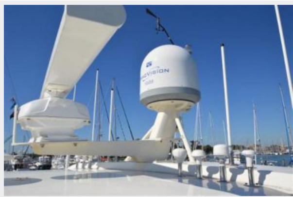
55 Fleming, Hardtop & Antennas