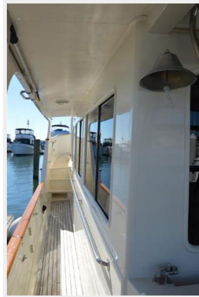
55 Fleming, Port Side Protected Walkway