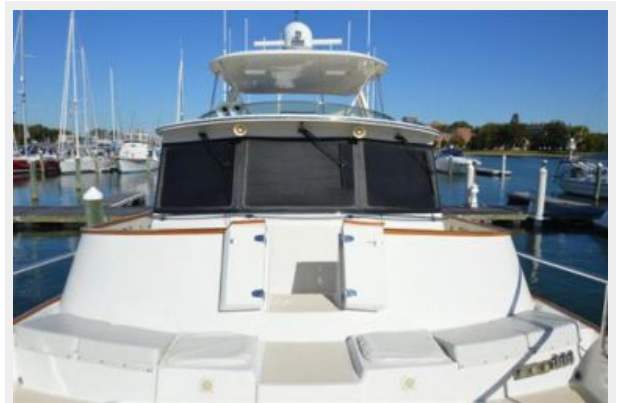
55 Fleming, Looking Aft