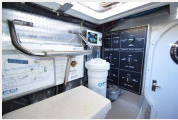
55 Fleming, FCI Watermaker