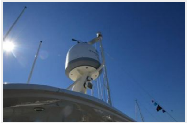
55 Fleming, Hardtop & Rear Facing Camera