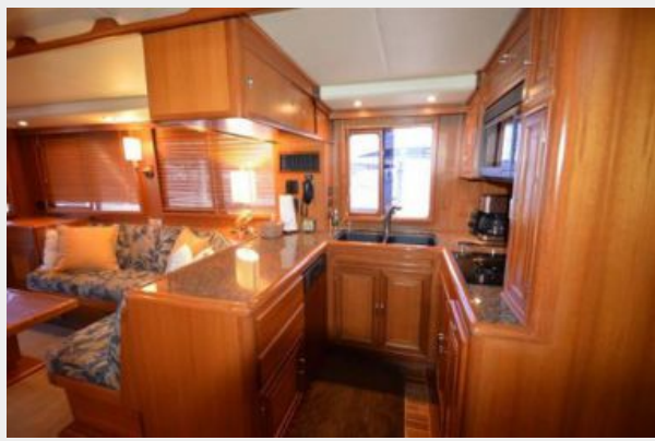
55 Fleming, Galley; note the Dishwasher