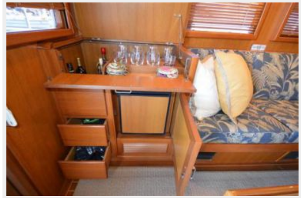
55 Fleming, Ice Maker and Refreshment Station