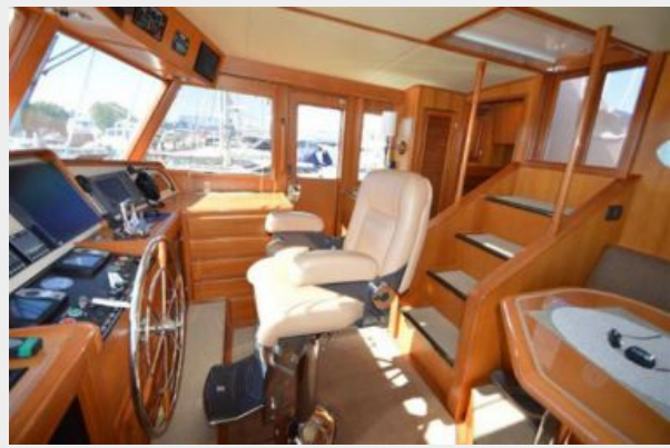
55 Fleming, Stbd Side Door