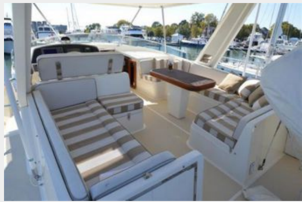
55 Fleming, Beautiful Bridge Deck