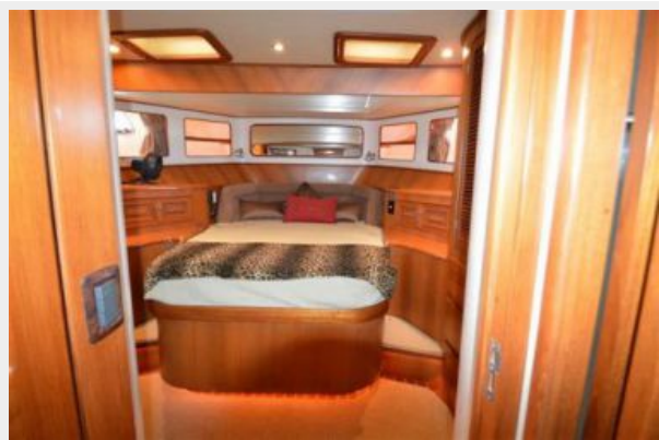
55 Fleming, Beautiful Master Stateroom