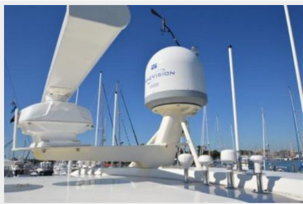
55 Fleming, Hardtop & Antennas