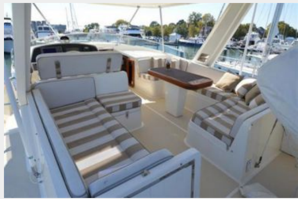
55 Fleming, Beautiful Bridge Deck