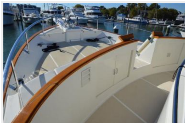
55 Fleming, Port Side Looking Forward