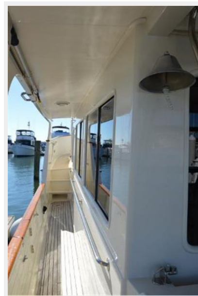
55 Fleming, Port Side Protected Walkway