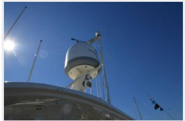
55 Fleming, Hardtop & Rear Facing Camera