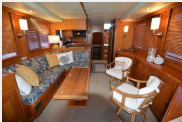
55 Fleming, Warm and Inviting Salon