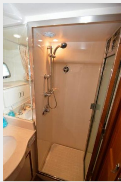
55 Fleming, Guest Head w/ Full Shower