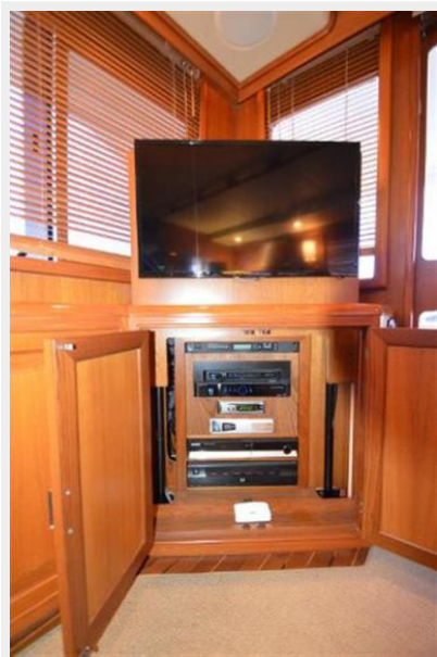
55 Fleming, Entertainment Center