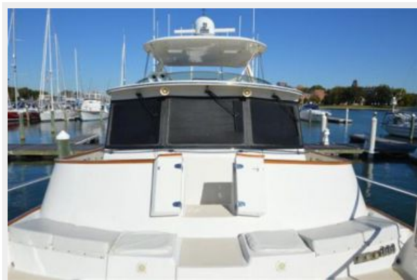
55 Fleming, Looking Aft