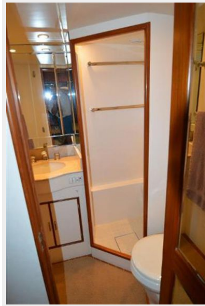
55 Fleming, Master Head w/ Marble Countertop and XL Shower