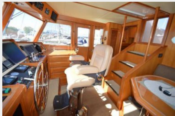
55 Fleming, Stbd Side Door