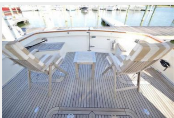
55 Fleming, Teak Cockpit; has Cockpit Sunshade