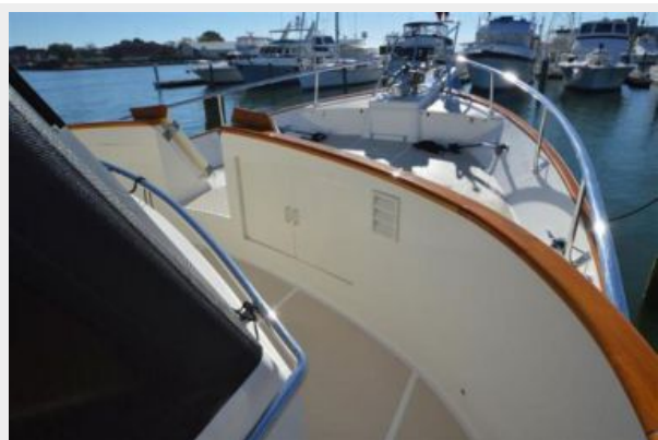
55 Fleming, Stbd Side Looking Forward