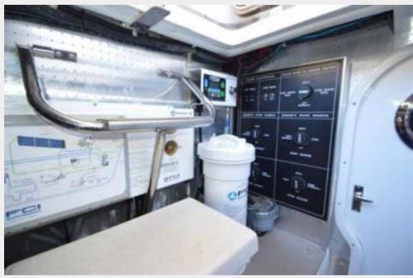
55 Fleming, FCI Watermaker