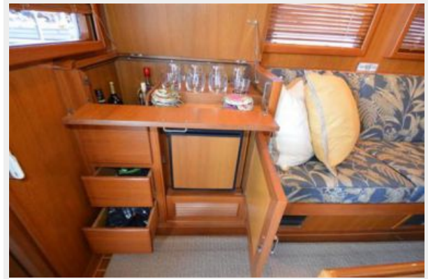
55 Fleming, Ice Maker and Refreshment Station