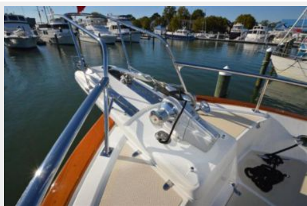
55 Fleming, Anchor Pulpit and Windlass