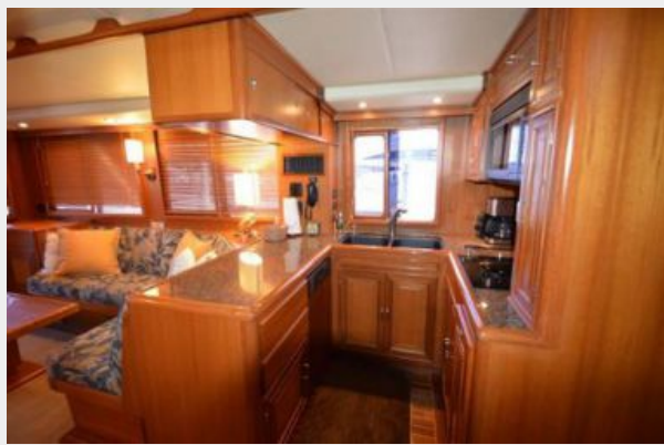
55 Fleming, Galley; note the Dishwasher