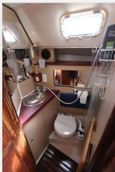
Head W/Shower, Stainless Sink, & Marine Toilet