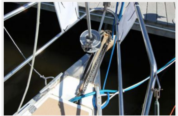
Bow Pulpit W/Plow Anchor