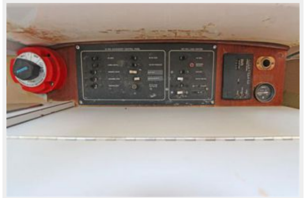
Battery Switch & AC/DC Electrical Panel