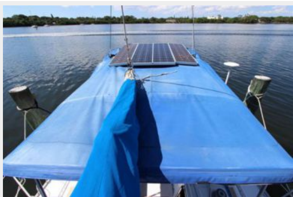
Canvas Bimini & Solar Panels