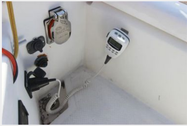
Horizon Marine VHF Radio