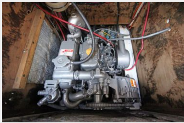
Re-Built 15 HP Yanmar Engine W/10 Hours