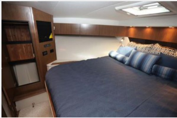
Port Hanging Locker Open