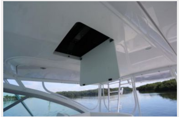
Teaser Reel Compartment