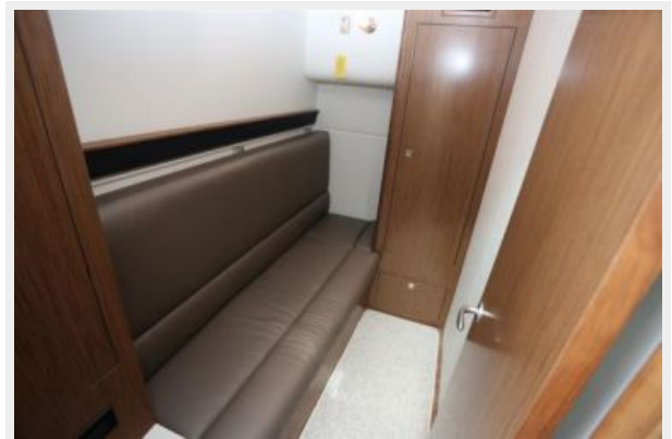
Aft Stateroom Pullman Berth Down