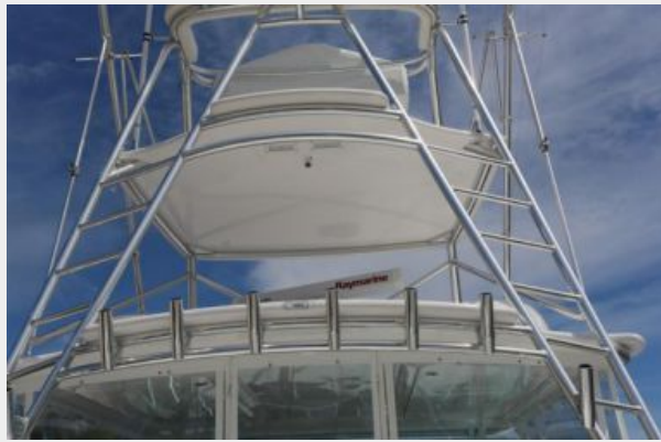
Palm Beach Tower