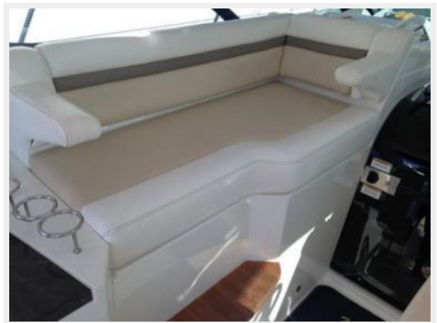
Port Side Lounge Seating