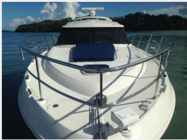
Front View 3