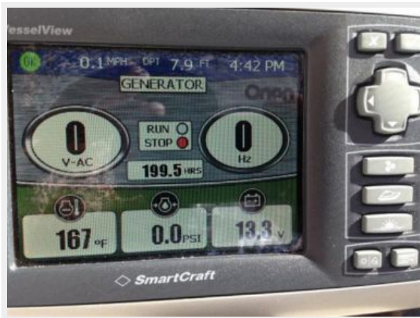
Generator Hours 10/14