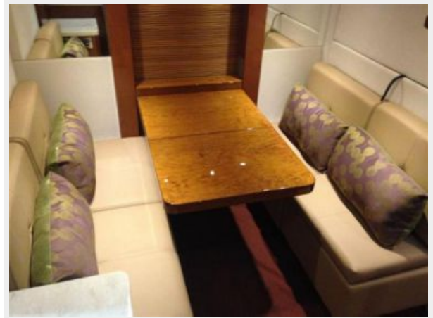
Mid Cabin w/Table Open