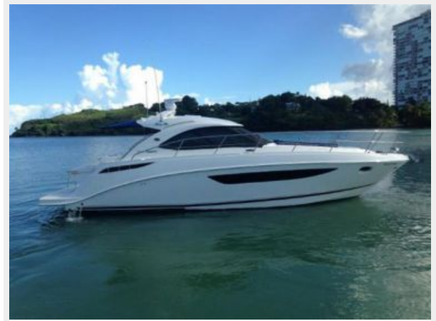
Stbd Side View 2