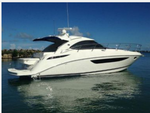
Stbd Side View