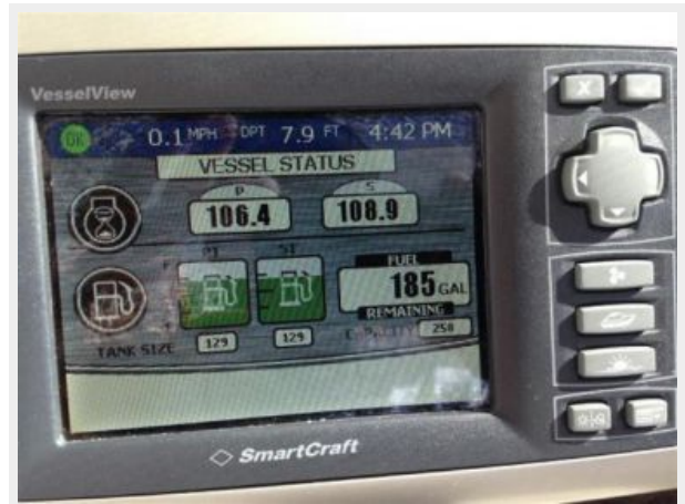
Engine Hours 10/14