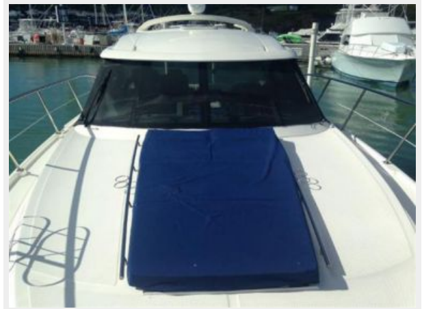
Fwd Sun Pad