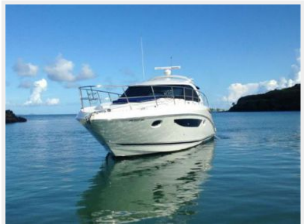
Front Port View