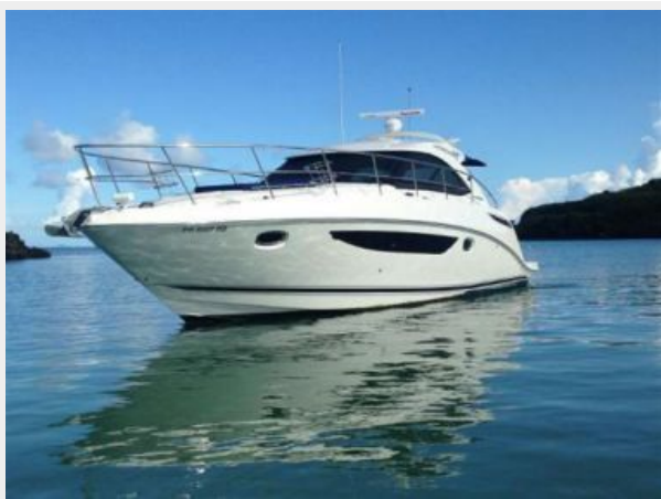
Front Port View 2