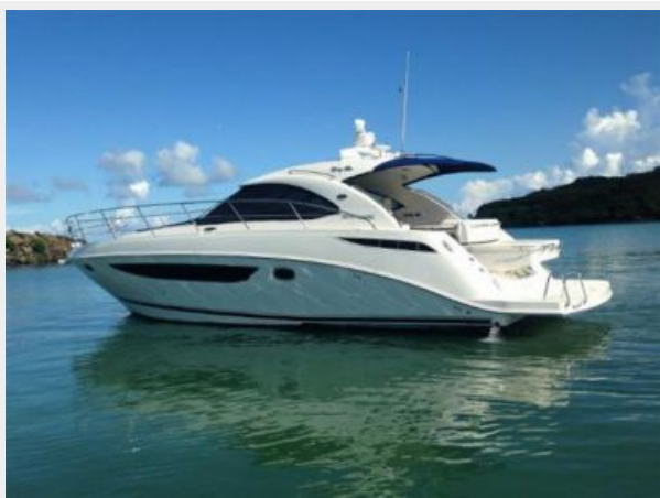
Port Aft View