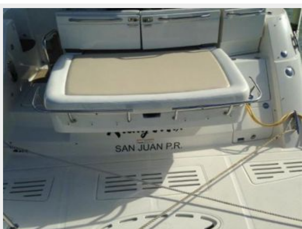
Aft Sun Pad w/Gates Closed