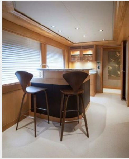
VIP Lounge Bar, Bridge Deck, Fwd View