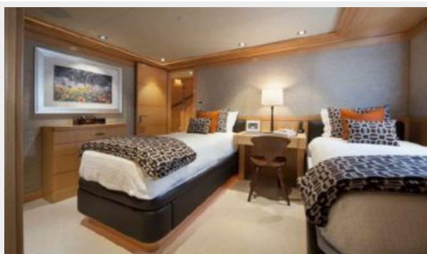
Guest Staterooms x 4, Lower Deck