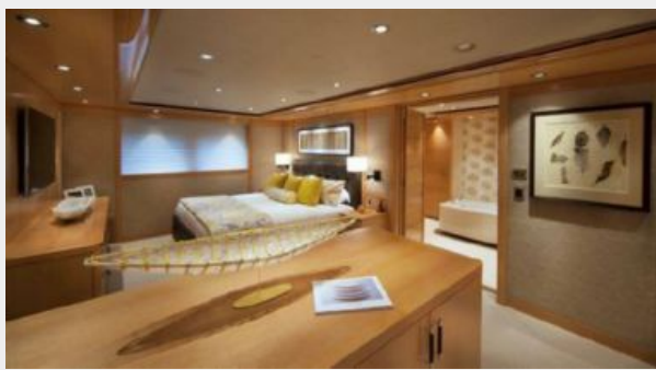
Master Fwd View to Head