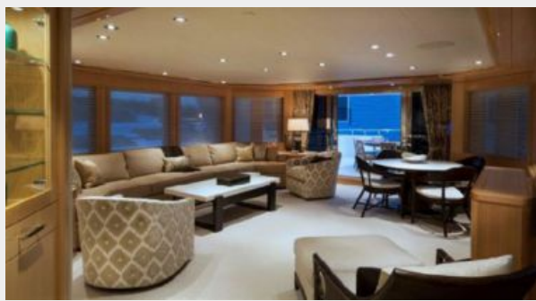
VIP Lounge, Bridge Deck, Aft view