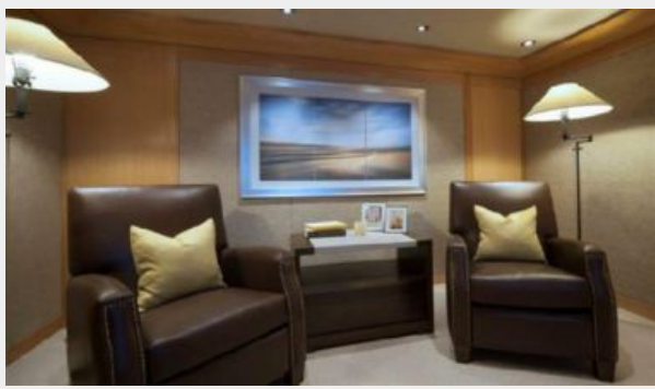
Master Office, Port View