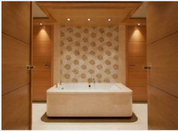
Master Spa Tub