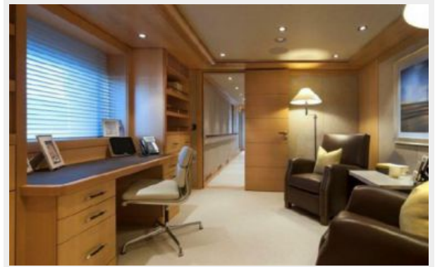
Master Office to Foyer