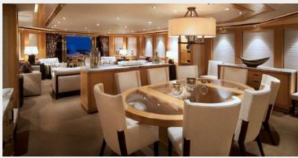
Salon Aft View