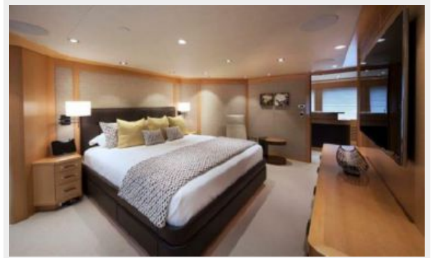
VIP Stateroom, Bridge Deck, Aft View