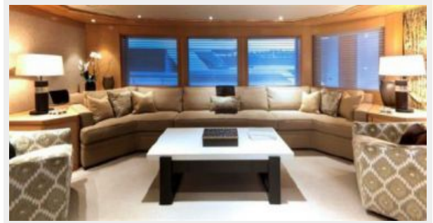
VIP Lounge, Bridge Deck, Stbd View