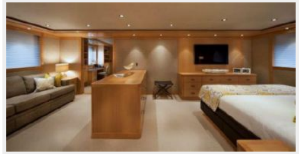
Master Stateroom, Aft View to Office and Foyer