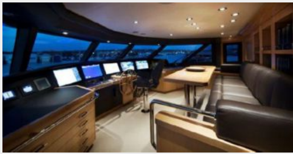
Bridge / Pilothouse