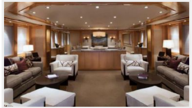
Salon Fwd View