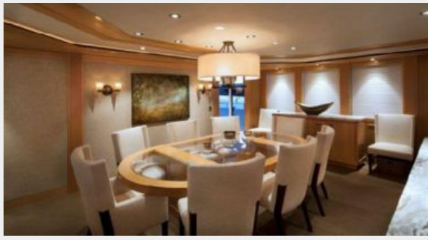
Dining, Stbd Fwd View