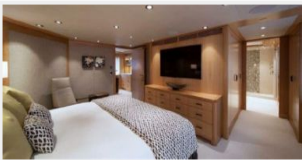
VIP, Bridge Deck, Forward View