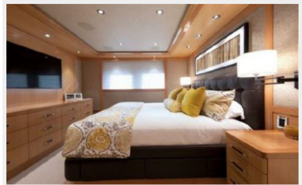
Master, Port View