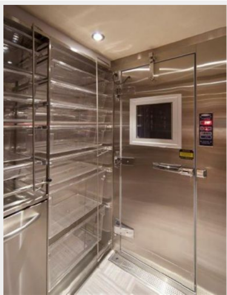
Galley Pantry, Walk-in Freezer