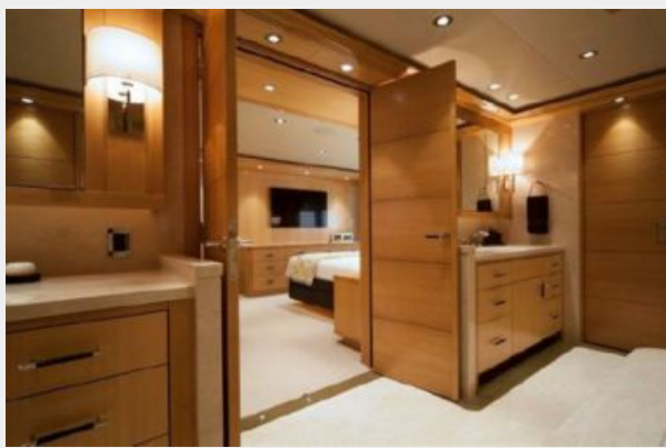
Master Head, Aft View