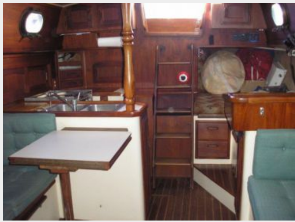
Main Cabin Looking Aft