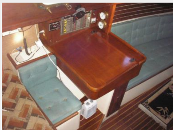
Nav Station & Quarterberth