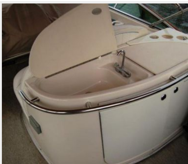
Flybridge Wet Bar