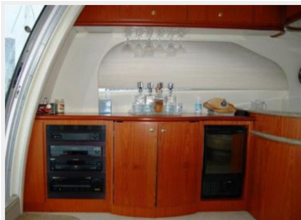
Salon to Port