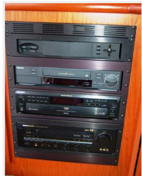
Salon Entertainment Center