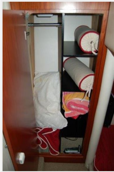
Guest Stateroom Storage Locker