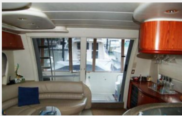
Salon looking aft