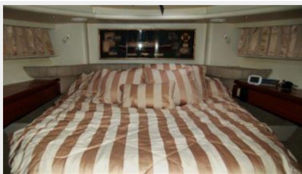
Master Stateroom Island Queen Berth