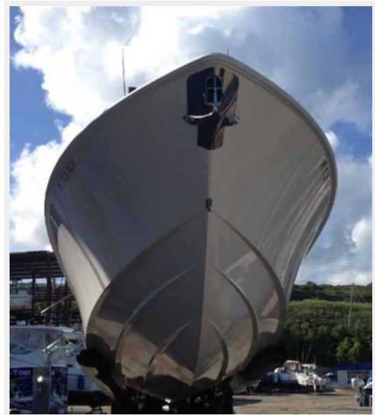
Hull Fwd Starboard