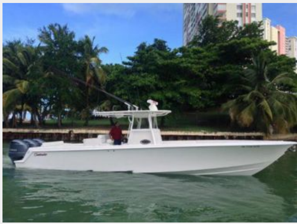
Contender 39 Starboard Side view