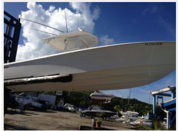
Bow Hull Bottom