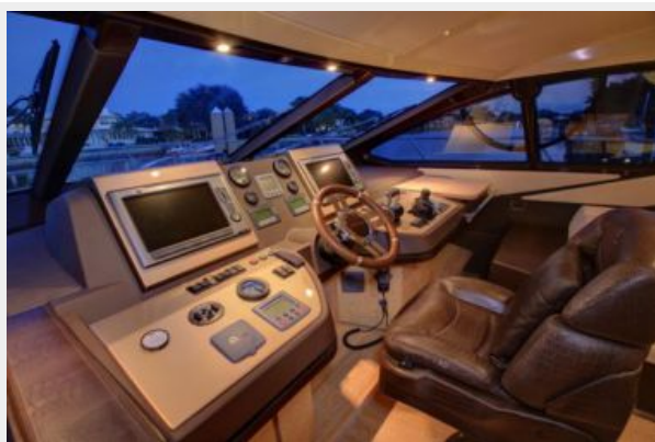
Lower Helm (2)