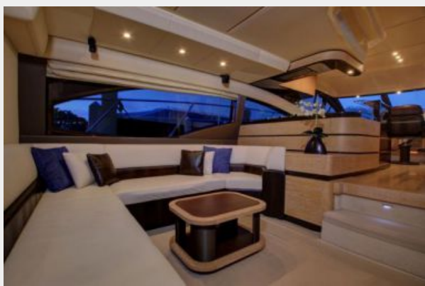
Salon to Port