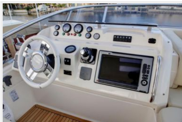
Flybridge / Electronics