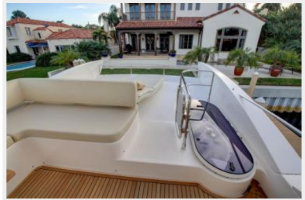
Flybridge Aft w/ Hatch Stairwell