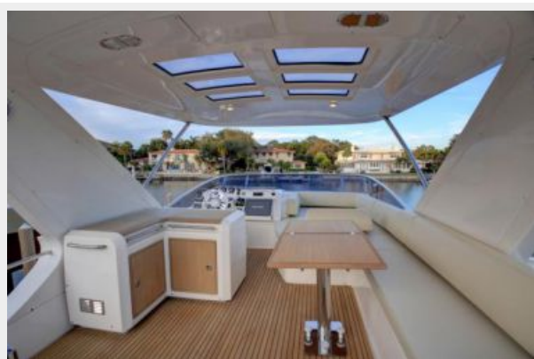
Flybridge w/Glass Inserts in Center - Hardtop