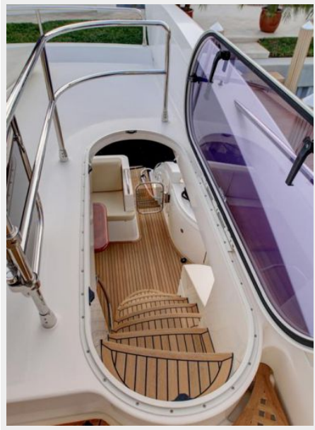
Bridge Hatch Stairwell to Aft Deck