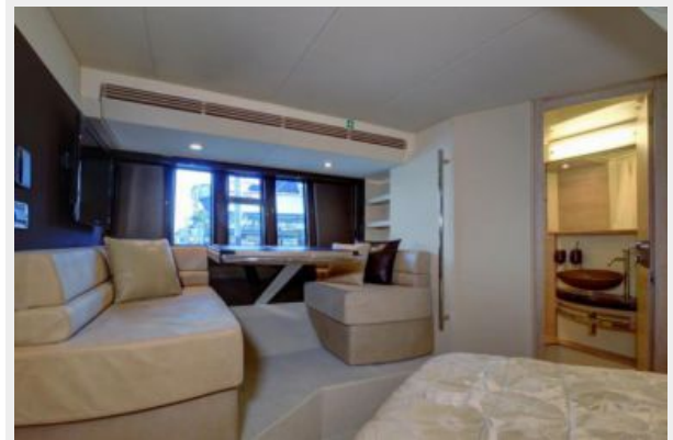
Master Stateroom (2)