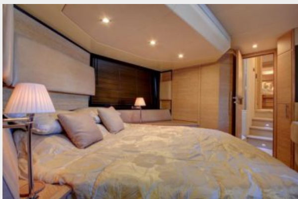
Master Stateroom (3)