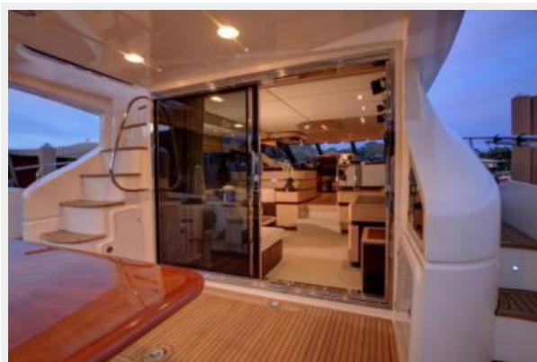
Aft Deck to Salon