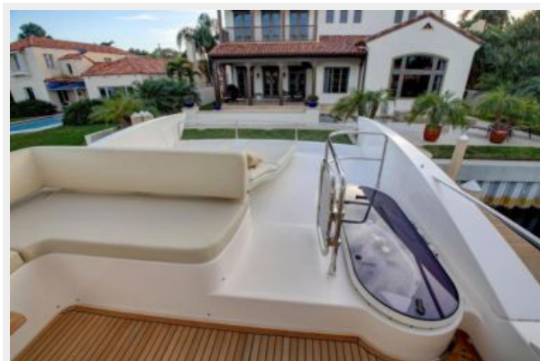
Flybridge Aft w/ Hatch Stairwell