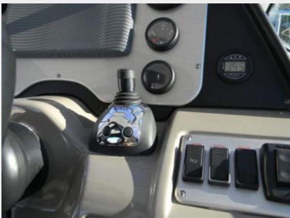
IPS Joy Control