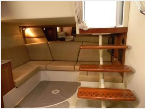
Mid- Cabin Aft Seating