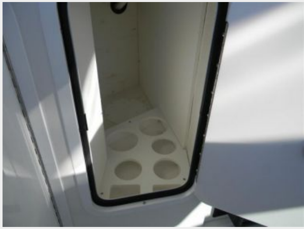
Cockpit Bottle Storage