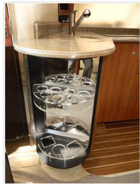
Salon Bottle Storage