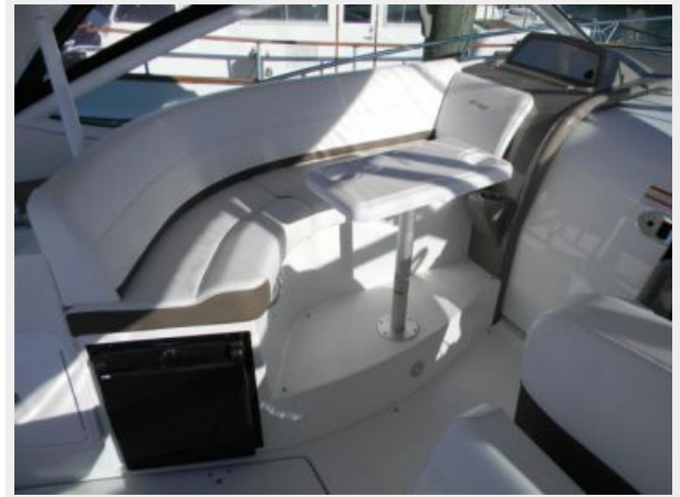
Helm Companion Seating