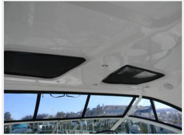
Hardtop & Skylites with Covers