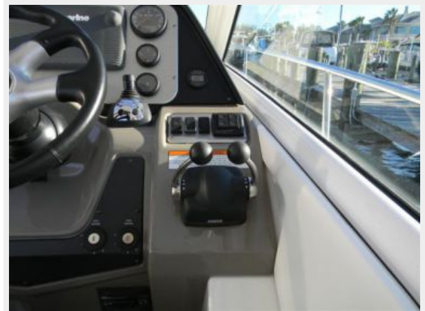
Electronic Controls & Joystick