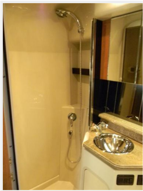
Separate Shower Stall