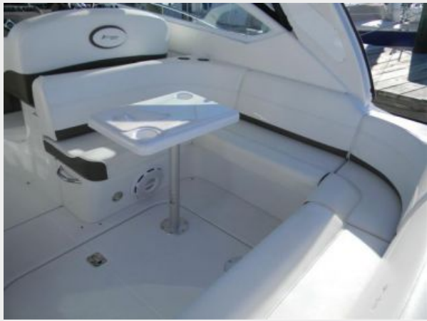
Aft Cockpit Seating