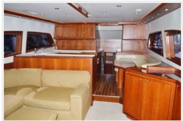
Salon / Galley